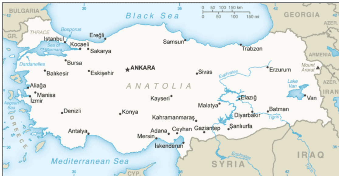
Map 1.1: Map of Turkey (The World Fact-book of CIA, 2017)

According to the World Factbook of the CIA (2017), these figures represent the estimated demographics of Turkey as of July, 2016: