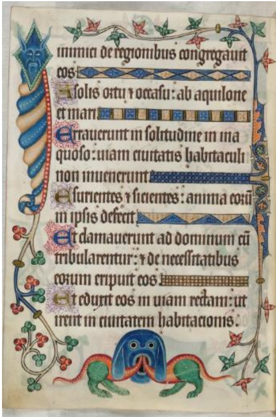
Figure 5.4: Luttrell Psalter f. 194v

One of the more fascinating things about the Luttrell Psalter is the sheer variety of images to be found within the manuscript. Alongside the wild imaginary creatures is a group of illustrations that echo a managed and regulated environment comparable to the