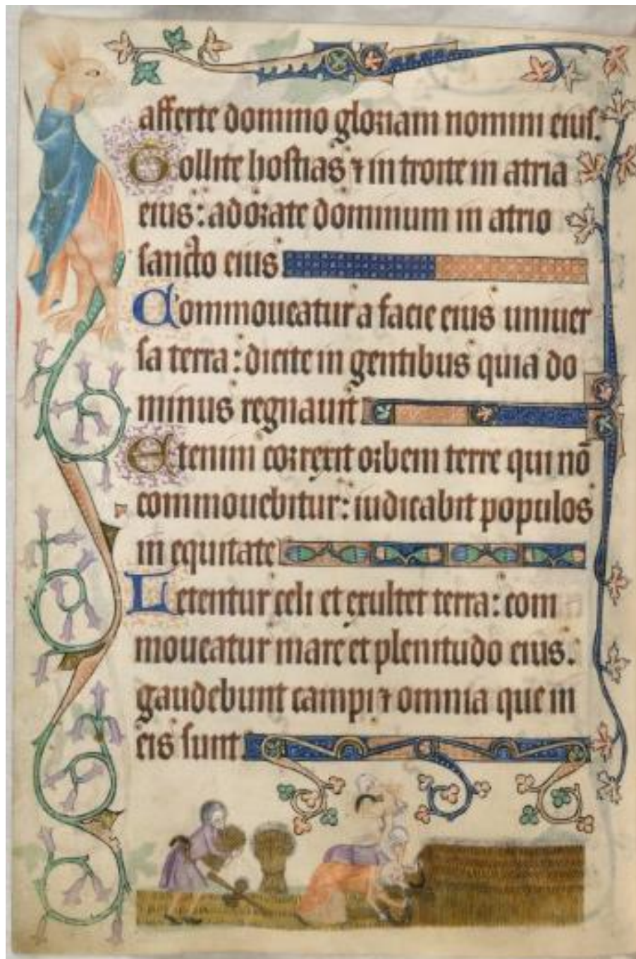
Figure 5.10: Luttrell Psalter f. 172v