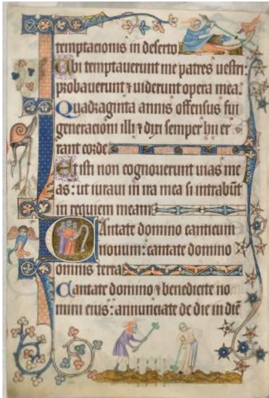
Figure 5.8: Luttrell Psalter f. 171v