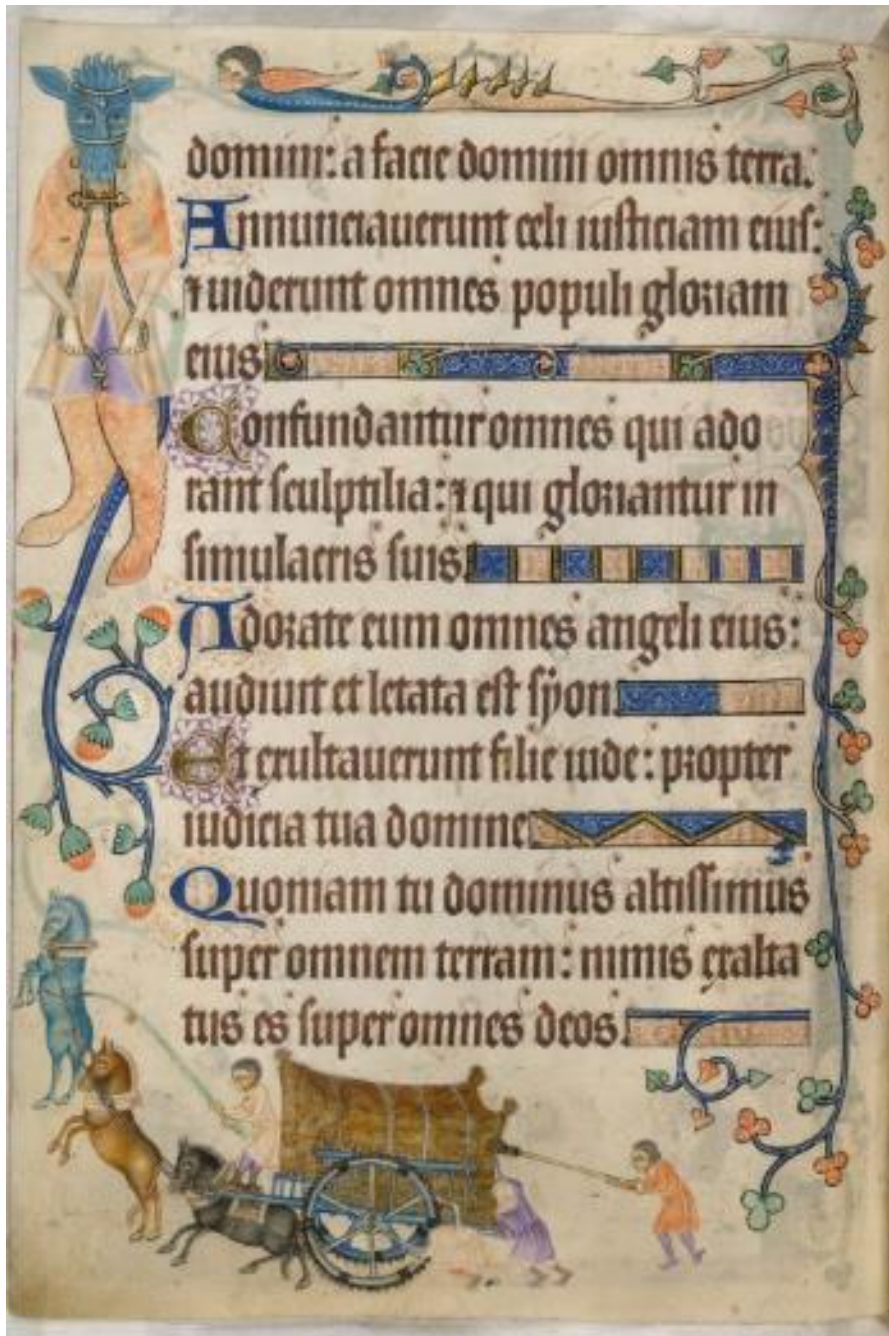
Figure 5.12: Luttrell Psalter f. 173v

For example, in Figure 5.6, a man sows seed from a basket, while a small dog chases the crows that are trying to eat the seed (f. 170v). Figure 5.9 (f. 172r) shows two women weeding a green grassy patch with the use of tools that allow them to hold the weeds with a forked pole in order to slice them with a metal blade at the end of another