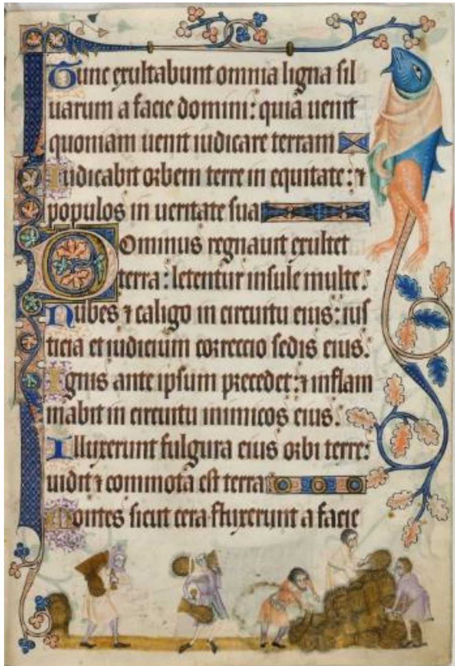
Figure 5.11: Luttrell Psalter f. 173r