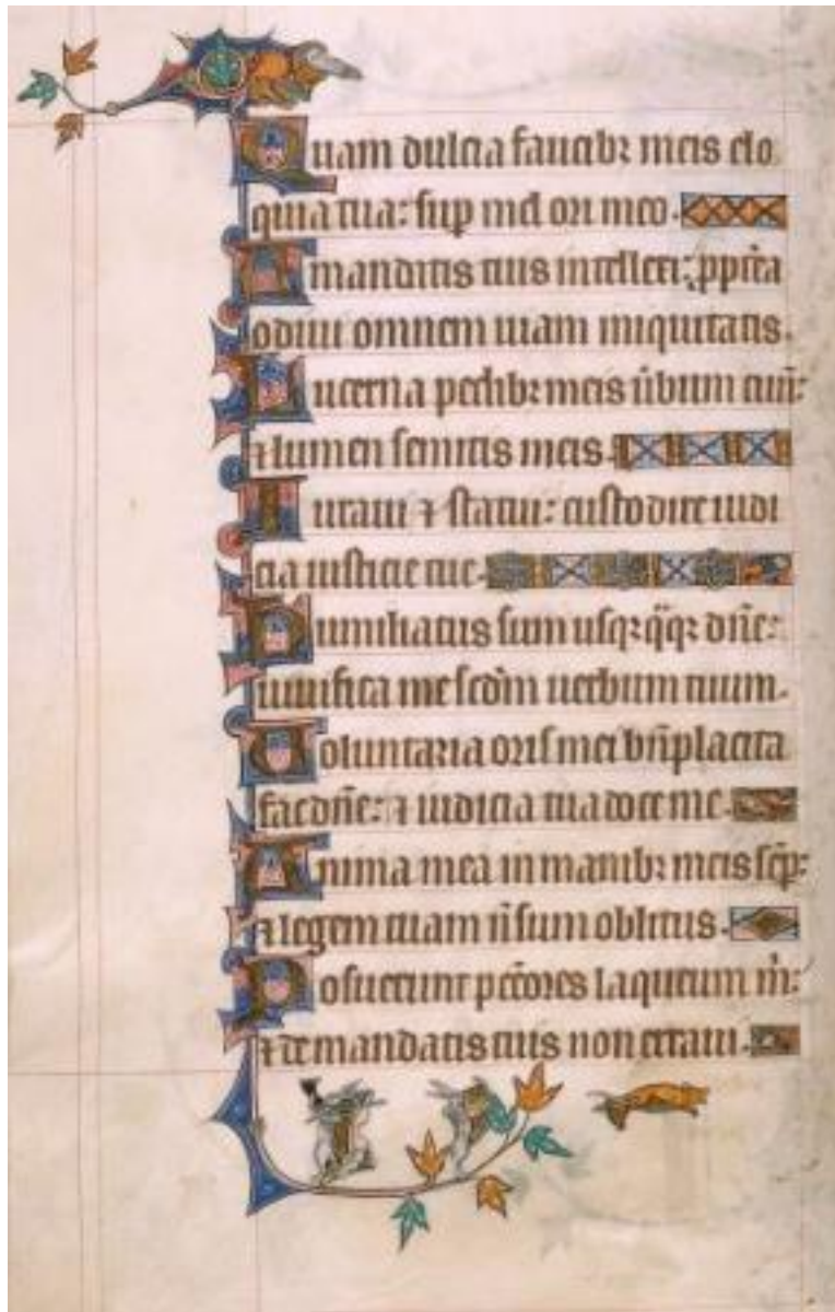
Figure 5.15: Gorleston Psalter f. 161v

The incongruent image gives the viewer pause as he must recalibrate his view on what is “normal” or “expected.” The components of the images—a knight, a snail, a rabbit, a hound—come with expectations as to their behavior and milieu . The Gorleston Psalter depicts these individually familiar images in unexpected ways and makes visible a sense of anxiety that evokes the paradox of the garden. How can something created by a person