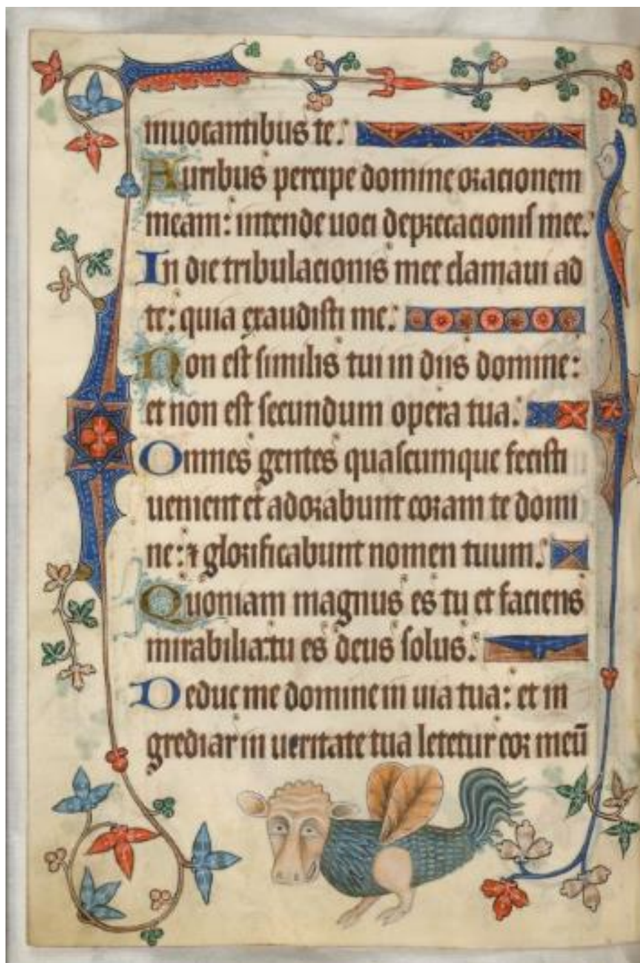
Figure 5.3: Luttrell Psalter f. 155v