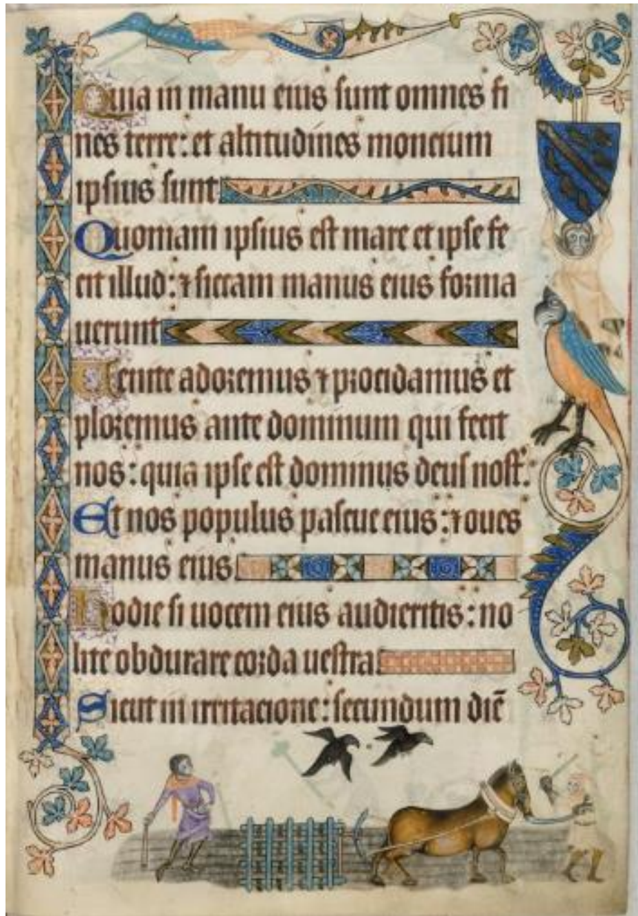
Figure 5.7: Luttrell Psalter f. 171r