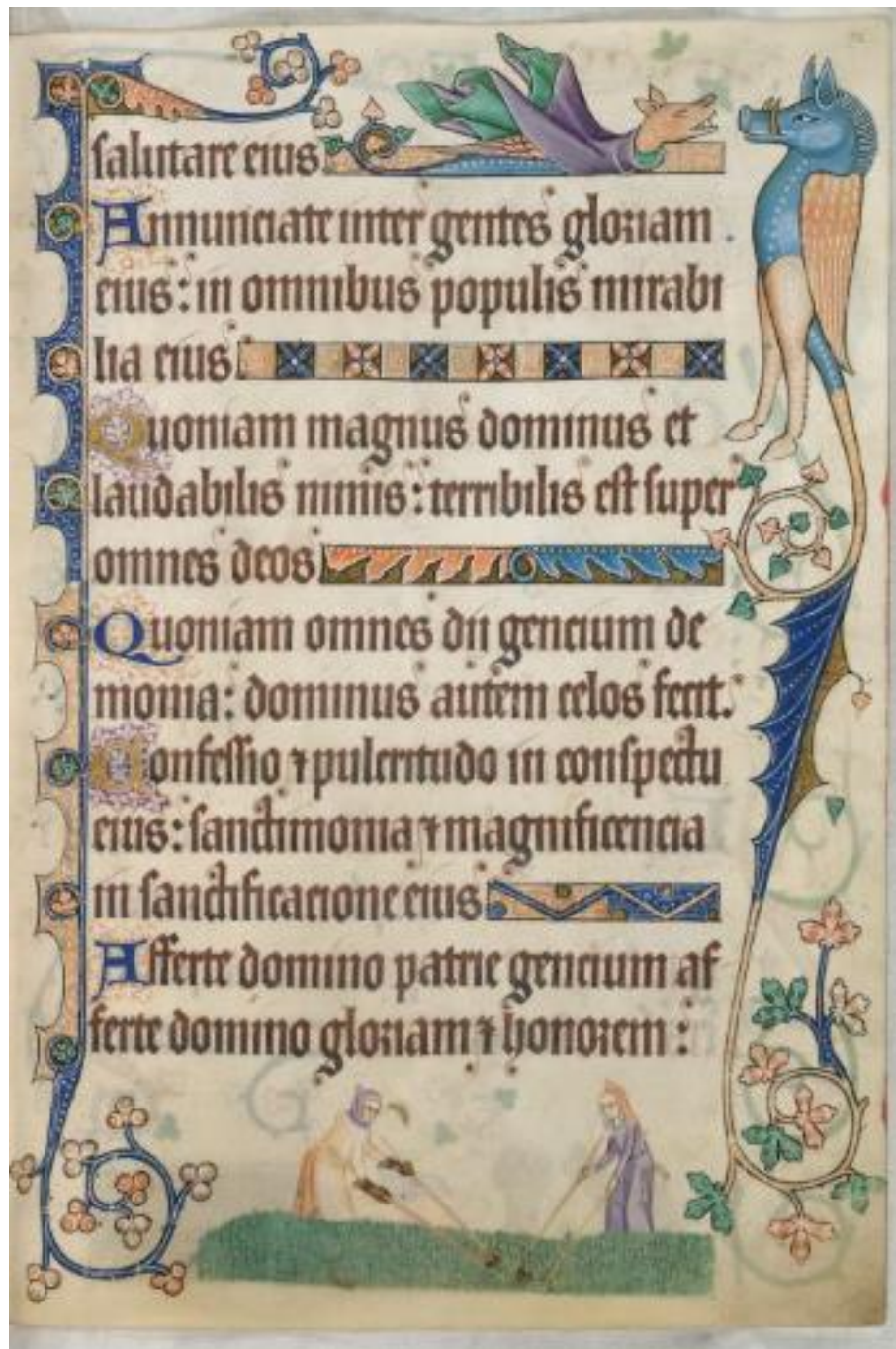
Figure 5.9: Luttrell Psalter f. 172r