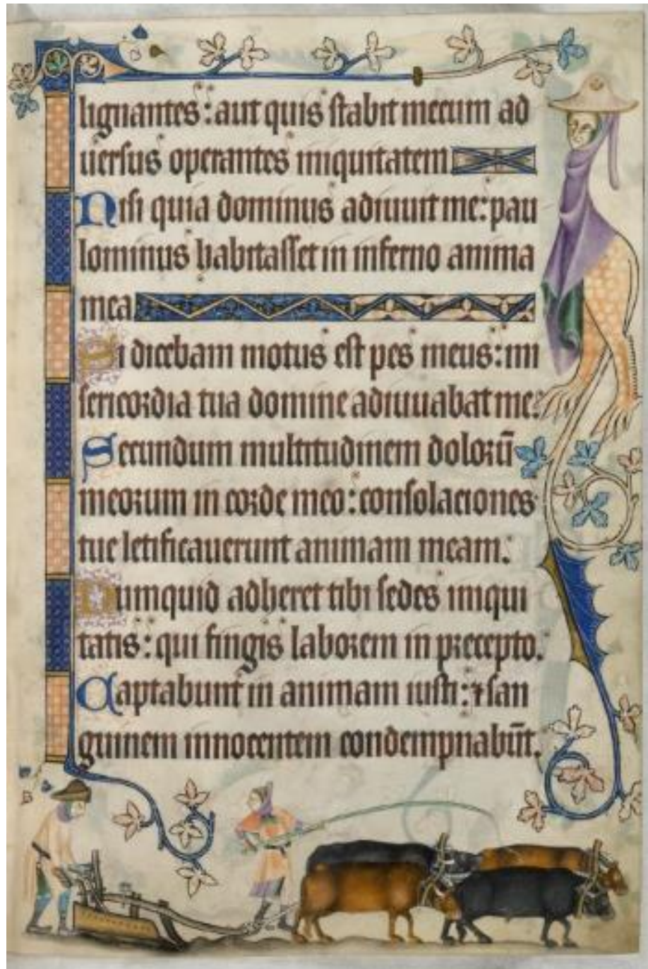
Figure 5.5: Luttrell Psalter f. 170r