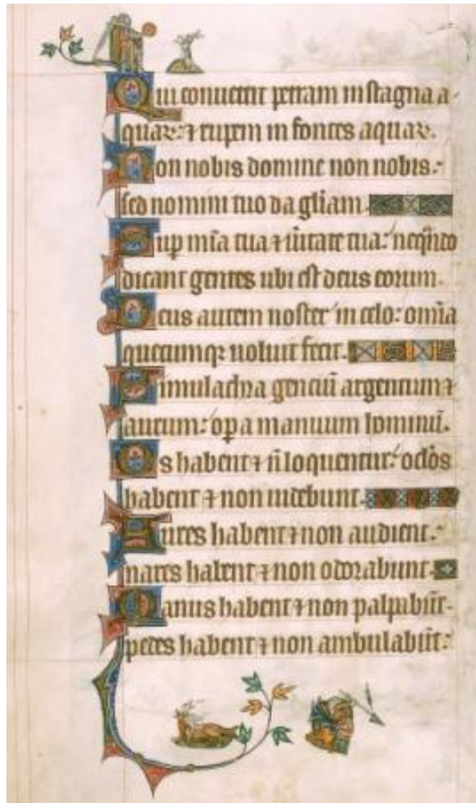
Figure 5.14: Gorleston Psalter f. 149v

The reversal of the hunter and the hunted roles between rabbits and hounds are some of the more surprising illustrations (See Fig. 5.15).