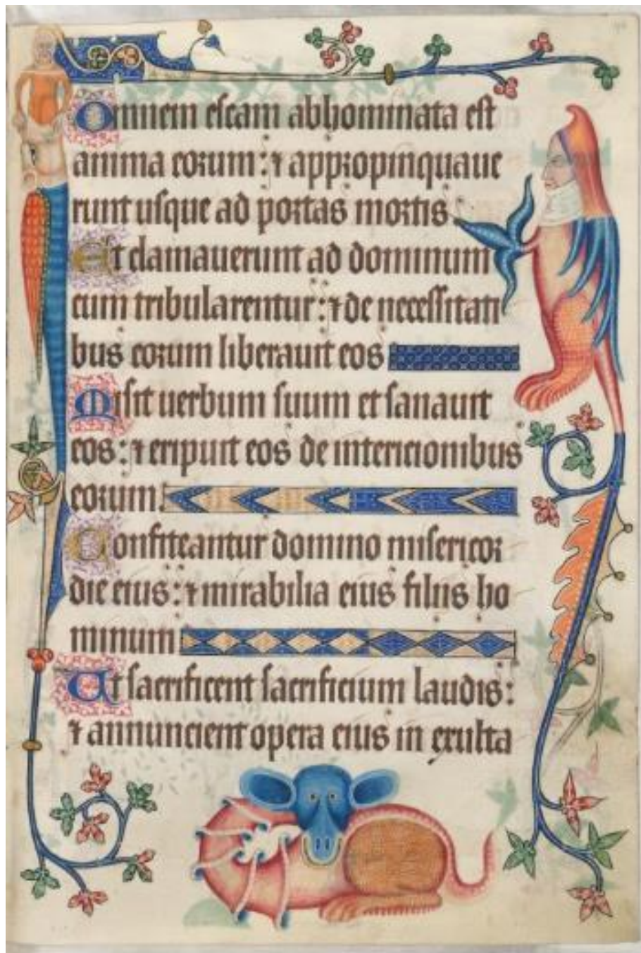
Figure 5.2: Luttrell Psalter f. 196r