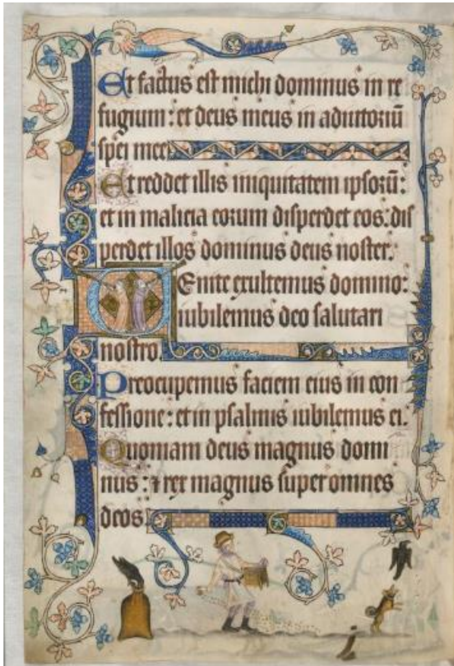
Figure 5.6: Luttrell Psalter f. 170v