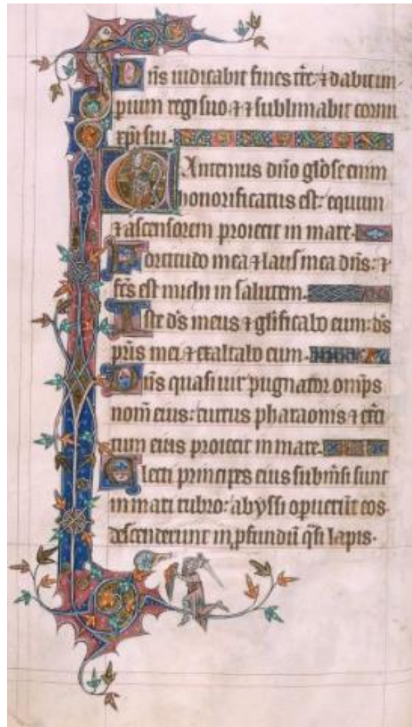
Figure 5.13: Gorleston Psalter f. 193v

imaginary situations. For example, there are several instances of knights in armor fighting snails or rabbits (See Figures 5.13 - 5.14).