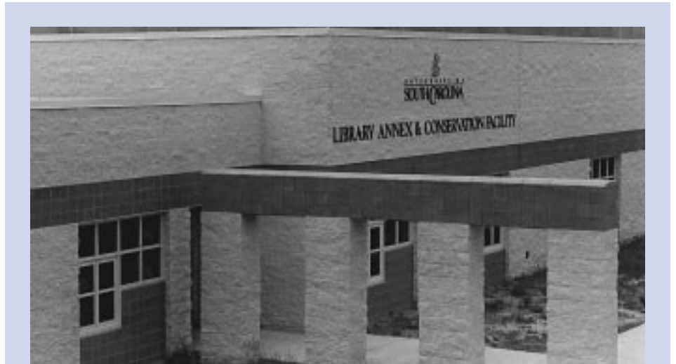
USC's Library Annex and Conservation Facility opened for business in August. Hundreds of books and other materials from the University's libraries have been transferred to the annex each week since then. For a detailed description of the activities necessary to make these transfers possible please see pages 6 and 7.

The two technology modules required of all University 101 students which are being taught in Thomas Cooper Library are Computing Resources/E-mail and Information Seeking. The modules are taught by librarians and by specially trained graduate students.