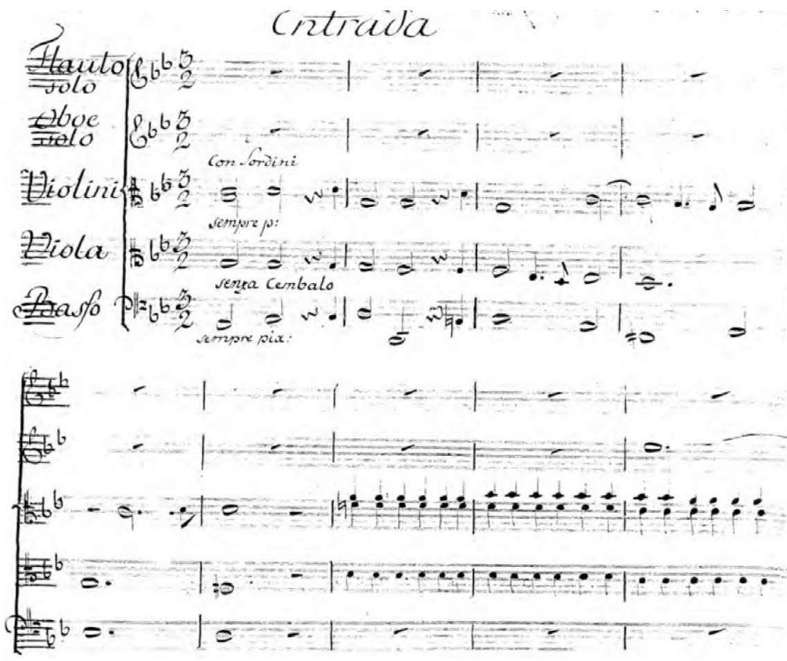
Figure 1.2 – Title page of Kantate auf den Tod Friedrichs (Hand-Copied Score)