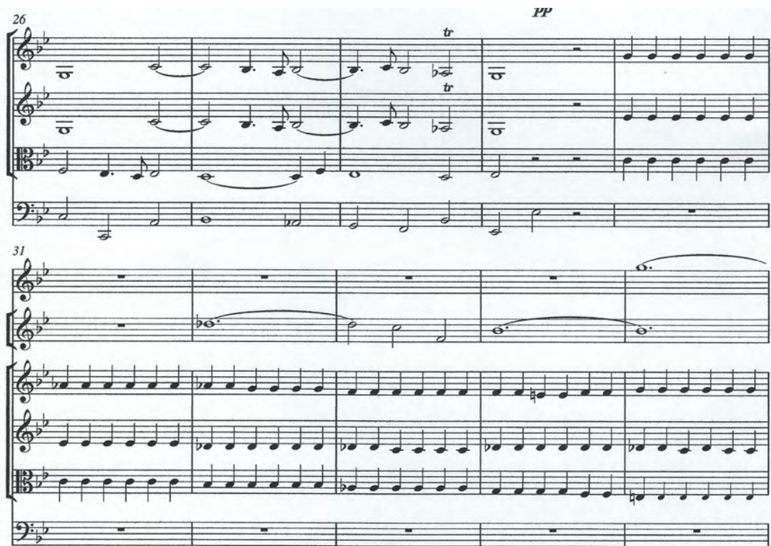
Figure 3.2 - Abrupt shift in modulation (Movement 1, mm. 29-30)