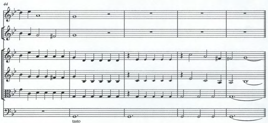
Figure 3.3 - Delaying the harmonic resolution (“Avoiding reality”) (Movement 1, mm. 47-48)