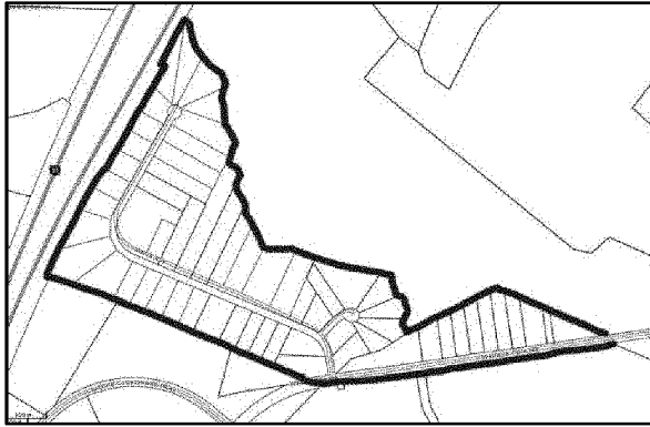
Figure 1a. Brandy Creek Before the Rock River Purchase 55

by renters—most living in manufactured housing. 52 Following the purchase, the renters were all evicted, eliminating nearly half of Brandy Creek’s population. 53 In the wake of residents being driven out, each parcel was cleared, leaving several remaining homes isolated and cutoff from neighbors. Reflecting on the decimation of their neighborhood, residents lamented that “[a]bout half of the people that lived in the neighborhood left,” “[l]ots of people had to move away[,]” and “[w]e used to have kids, but now we have no kids.” 54