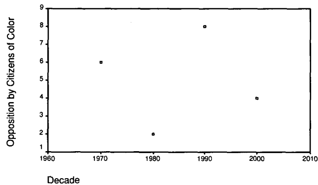
FIGURE 2. OPPOSITION BY COMMUNITIES OF COLOR AND DOJ OBJECTIONS: SOUTH CAROLINA, 1972–2004

For example, of forty-three objections interposed by the DOJ throughout the 1970s, six explicitly denied preclearance because communities of color opposed the proposed changes. The 1990s show a similar trend: eight of thirty-one denials explicitly stated the opposition of communities of color. As Figure 2 shows, the DOJ has relied on communities of color from South Carolina throughout the four decades of Section 5 administration.