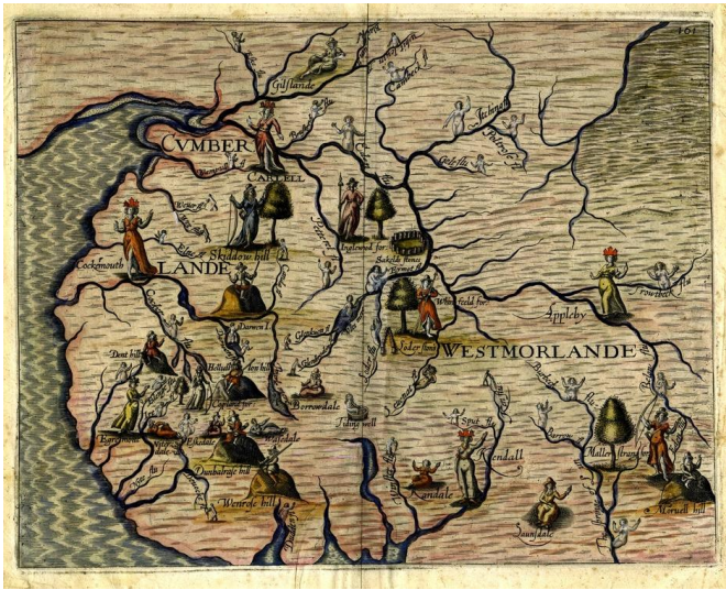
Fig. 2. “Cumberlande and Westmorlande,” engraved by William Hole, in Michael Drayton, The Second Part, or a Continuance of Poly-Olbion (London: Mariott, Grismand and Dewe, 1622).

This expanded description appeared in every subsequent edition of Camden's book, including Philemon Holland's English translation in 1607. Where Camden came across the proverb remains obscure, though, given that he added it after his 1599 visit to Cumberland, it seems plausible that he learned of it then.