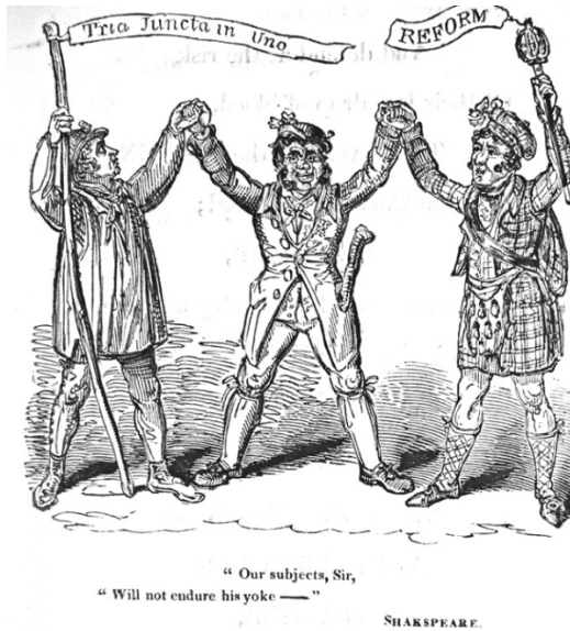
Fig. 1 3

their stories have often been hijacked by critics concerned with promoting the notion of an independent Scotland. But here I want to reconnect the rebellions in Scotland and England, and argue that they were the result of a government initiative designed to discourage revolution at a time when it appeared to many that one was imminent. 2