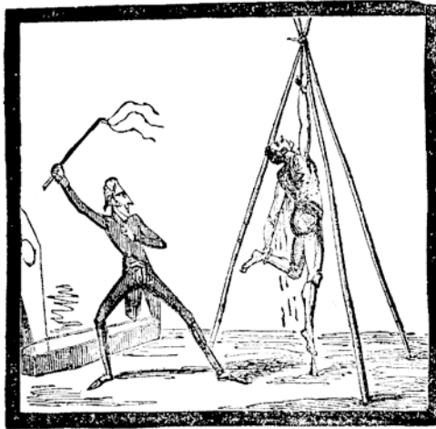
Fig. 4 67