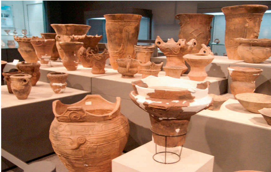
Fig. 1: Jomon pottery from central Honshu, Japan.

(e.g. ducks), fishes (e.g. carp and salmon), and shellfish (e.g. clams and oysters) that were easily exploited from the shore, or by netting, trapping, and by canoe (Seguchi 2009). Their homes were typically small, circular (10-12 feet / three-four meters in diameter) semi-subterranean pit houses with floors dug a few feet (ca. one meter) beneath the surface of the ground and could house four to six people (although exceptionally large examples could hold many more). The houses contained excavated pits for storing food and other goods and often had central hearths for cooking and heat in winter months (Fig. 2). The walls and roof were thatched and anchored to wooden poles. Most archaeological sites contain four to five houses arranged in a circle and facing a small central plaza, often representing a small population of 30 to 40 people.