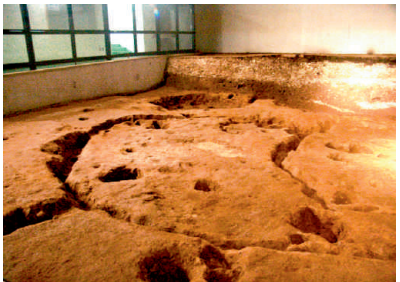
Fig. 2: Jomon pithouse features and shell midden.

The Neolithisation and Modernisation of East Asian Inlands Seas (NEOMAP) project of the Research Institute for Humanity and Nature (RIHN), Kyoto, is exploring the development and change in prehistoric cultural landscapes throughout the region and beyond (Uchiyama 2009). Geographic research by the NEOMAP GIS research team (AKA G.I.S. Joes) is exploring the