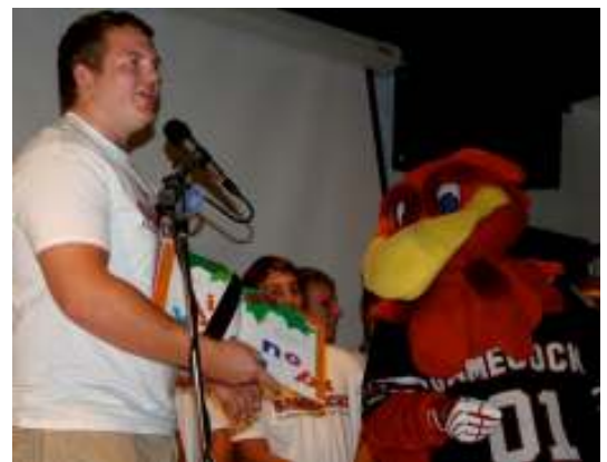
Cocky and 22 USC football players entertained hundreds of children at Pigskin Poets, a special Summer Reading Club Celebration now in its tenth season, at the Richland County Public Library.

Several players read books to the crowd during the event, which also featured songs, games and an autograph session.