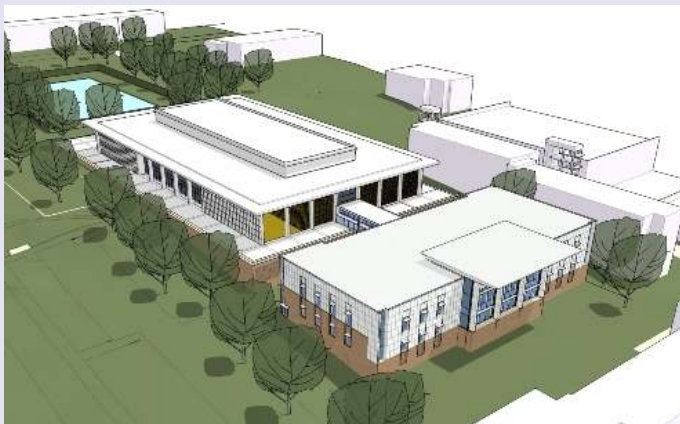
Architect's drawing of the new special collections building

Plans to create new spaces for the University Libraries' special collections have been changed; instead of two separate wings added to the Thomas Cooper Library to house Rare Books and Special Collections and South Carolina Political Collections, a single building will be constructed behind the library which will house both collections.