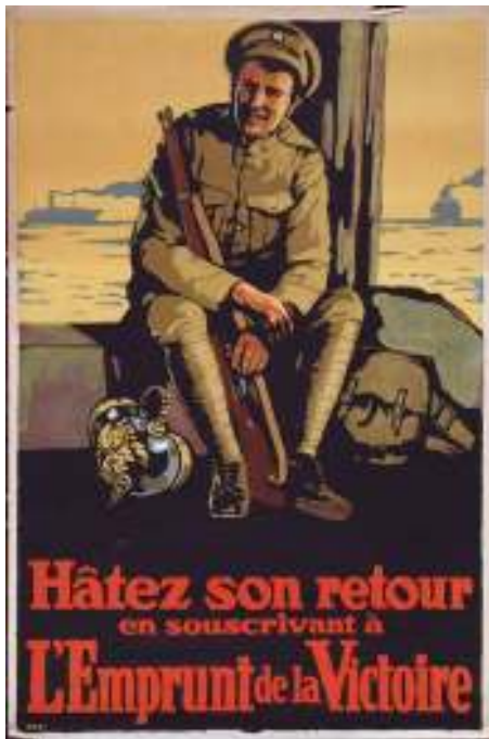
"Hasten His Return..."

WWI poster from the exhibit "Voices of the Great War"