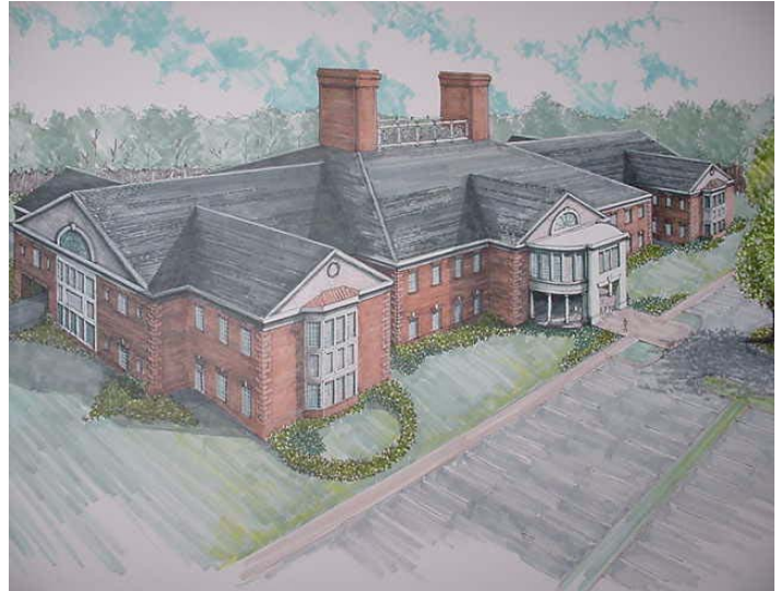
Pickens County Headquarters Library—Easley

The Drs. Bruce and Lee Foundation Library of Florence County is presently under construction on Dargan Street. This impressive limestone structure was made possible due to a generous ten million dollar grant from the Drs. Bruce and Lee Foundation and a seven million dollar bond ordinance from Florence County. When finished, the 82,000 neo-classical style building will be the largest per capita public library in South Carolina. The children's room in the Drs. Bruce and Lee Foundation Library will be one of the largest children's rooms of any public library in South Carolina. Seventy-five public Internet stations will permit patrons to do research with little or no waiting. A 25-seat technology lab for training purposes will be available for use by distance education classes. The South Carolina Room will contain a climate-controlled vault. The library will also boast a state-of-the-art 250 seat meeting room. Five study rooms, with two large enough for 10-12 people will be available for use by patrons. Memorabilia from The Drs. Bruce and Lee Foundation will be featured in a permanent display. Ample parking with 272 spaces will be available for patrons. Security for materials, patrons, and staff will be enhanced with