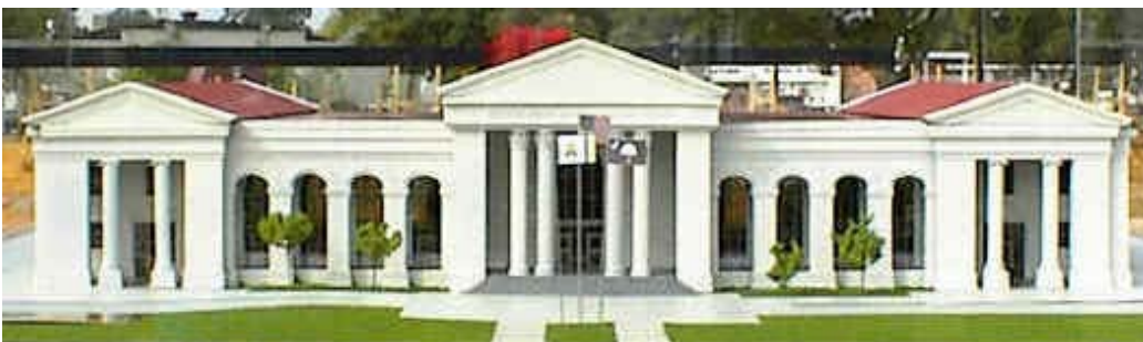
Drs. Bruce & Lee Foundation Library—Florence

The Drs. Bruce and Lee Foundation Library of Florence County is presently under construction on Dargan Street. This impressive limestone structure was made possible due to a generous ten million dollar grant from the Drs. Bruce and Lee Foundation and a seven million dollar bond ordinance from Florence County. When finished, the 82,000 neo-classical style building will be the largest per capita public library in South Carolina. The children's room in the Drs. Bruce and Lee Foundation Library will be one of the largest children's rooms of any public library in South Carolina. Seventy-five public Internet stations will permit patrons to do research with little or no waiting. A 25-seat technology lab for training purposes will be available for use by distance education classes. The South Carolina Room will contain a climate-controlled vault. The library will also boast a state-of-the-art 250 seat meeting room. Five study rooms, with two large enough for 10-12 people will be available for use by patrons. Memorabilia from The Drs. Bruce and Lee Foundation will be featured in a permanent display. Ample parking with 272 spaces will be available for patrons. Security for materials, patrons, and staff will be enhanced with