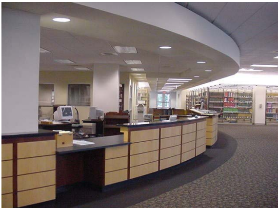
The Medford Library—USC Lancaster