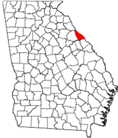
Figure 2: Lincoln County, Georgia