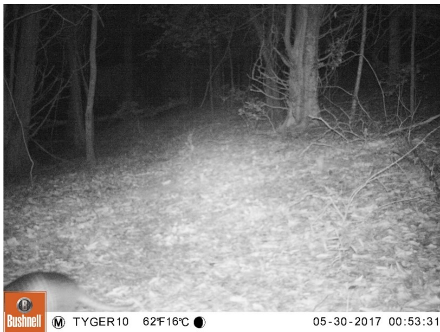
Figure 1. Nine-banded armadillo ( Dasypus novemcinctus ) photographed in Spartanburg County, South Carolina on 30 May, 2017.

In the coming decades, armadillos will likely continue their northward range expansion across South Carolina and the surrounding states. We encourage others to report armadillo sightings so that researchers can effectively track their range expansion.