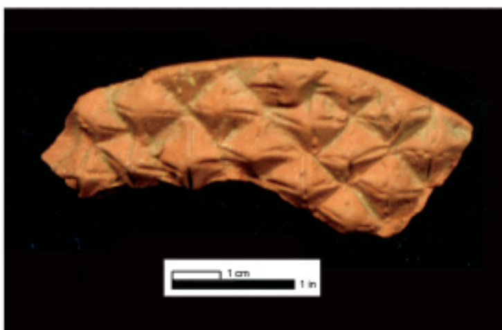
Fig. 2: This unglazed pineapple redware sherd is unique to the Bartlam site.

In addition to the stylistic similarities, waster sherds found at Cainhoy revealed chunks of refined redware embedded in the emerald green glaze of wares from the site. The red clay intrusions are most likely from slippage during the firing of the kiln, an occurrence familiar to potters everywhere.