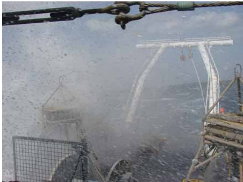
Fig. 1b: A wave breaks over R/V Endeavor 's rail drenching the instruments lashed on the aft deck.

The project was part of an ongoing collaboration between SCIAA's MRD and USC's Department of Geological Sciences that has spanned some five years.