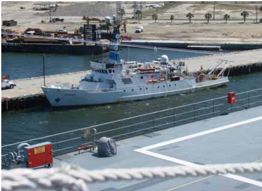
Fig. 2: R/V Endeavor taken from the significantly larger U. S. Navy Ship Dahl in Charleston.

post depositional history of the H. L. Hunley site, prioritize areas to survey for the remains of Lucas Vazquez de Ayllon's lost Capitana, and survey for Confederate cannons in the waters of Charleston Harbor (Fig. 3).