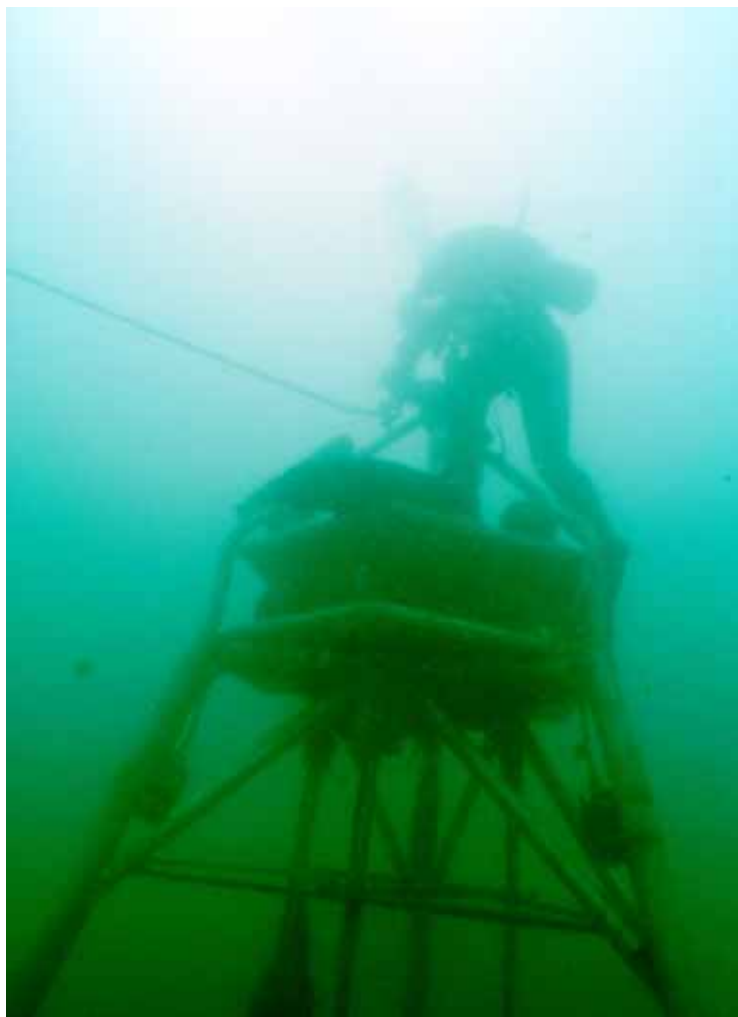
Fig 5: Dr. Paul Work, who worked with USC and USGS on the South Carolina Coastal Erosion Study, attaches a shackled lifting line to a "Bigfoot" off Myrtle Beach.

devices manually lowered to the seafloor through diver assistance (Fig. 7). They are attached to computers on the pier, via cabling running on the seafloor, where wave and current data is sent to the CPSD lab in Columbia to be processed, archived, and posted on various web sites. Maintenance of the monitoring systems involves locating the ADCPs, disconnecting them and raising them to the surface for replacement. MRD staff rapidly locates and recovers the acoustic systems so that they can be maintained to insure continuous data collection. Data from the two ADCP units located off Springmaid and Folly piers can be accessed at