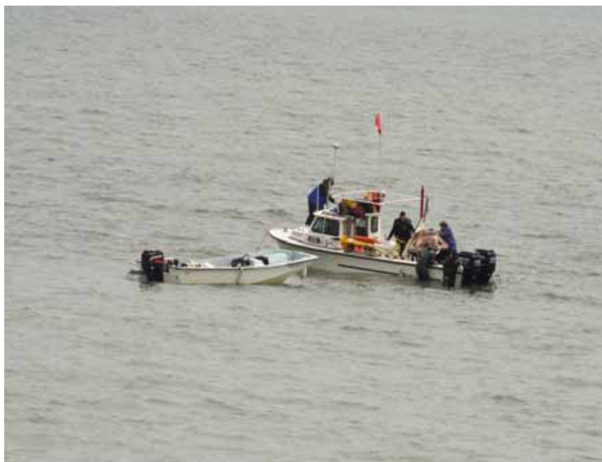
Fig. 6: Staffs of the MRD and USC's Department of Geology recover an ADCP unit from the seabed 1,500 feet off Folly Pier.

http://www.geol.sc.edu/gvoulgar/waves.html .