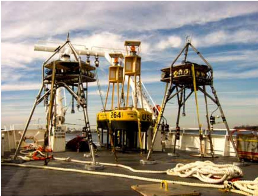
Fig. 4: Two "Bigfoot" instrumentation platforms awaiting deployment aboard R/V Endeavor.

Carolina bedform projects involve placement of sonar imaging and particle measuring instruments on observation tripods in specific types of sediment (Fig. 4). The divers assist in these efforts by conducting pre-deployment surveys of the intended sites, establishing the exact positions where the platforms will be placed for periods of months. When the platforms are recovered MRD staff enters the waters where the platforms are collecting data to locate them. A signaling device assists in the location of the platform by sending an acoustic ping to a diver operated receiver. Once the platforms are located the divers use recovery lines to attach the platforms to large inflatable buoys on the surface of the water (Fig. 5).