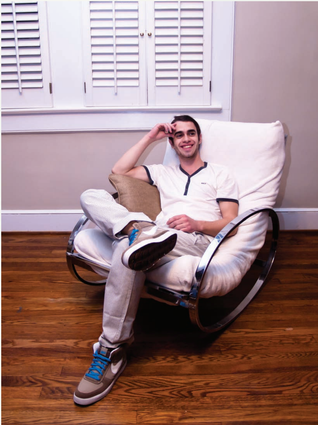
This page: Shirt and shoes, Salty's Surf Shop; pants, American Apparel. Facing page: Shirt and shorts, Brittons; shoes, Salty's Surf Shop.