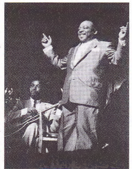
Green performing with the Count Basie Orchestra. Count Basie is in the foreground.

Of special interest and value to researchers are the more than 165 photographs in the collection. The images trace Green's career from his earliest performances up to the 1980s. Included in the collection are an early picture of Green with a band called "Lonie Simmons and His Rhythm Chicks," formal and informal black and white portraits of Green with Basie and the band, and candid snapshots showing Ella Fitzgerald with Green and the Basie outfit in performance at Frankfurt in