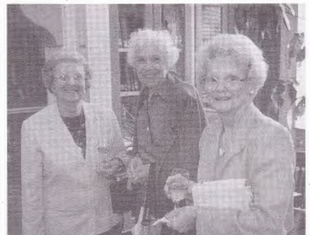
Society members enjoy the morning reception at the Caroliniana.