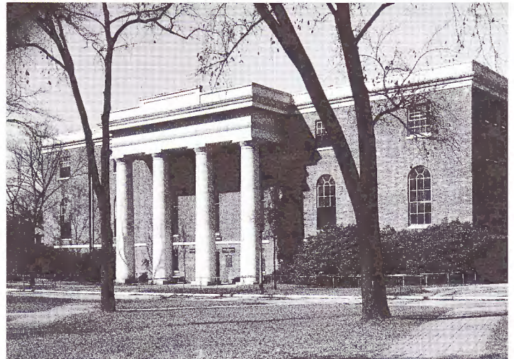
South Caroliniana Library after the addition of the two fireproof wings.