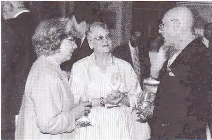
Society Members enjoy the morning reception at the Caroliniana.