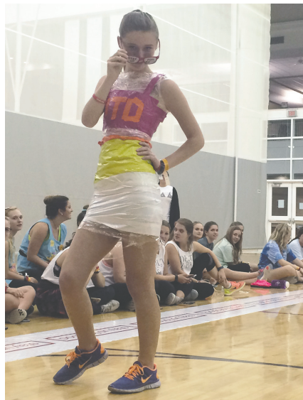
Emily Barber / THE DAILY GAMECOCK