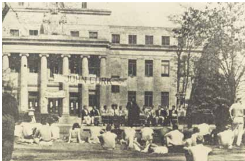
McKissick Library, mid-20th century

Since 1805, when the South Carolina College held its first classes, students have played a vital role in the development of campus life. During this time, students have been instrumental in the growth of religious life, student government, sports, and Greek organizations. From August through December 2006, visitors will be able to view the work of sixteen graduate students in the Museum Management Program who organized this exhibition dedicated to the diversity and history of student life at the University of South Carolina.