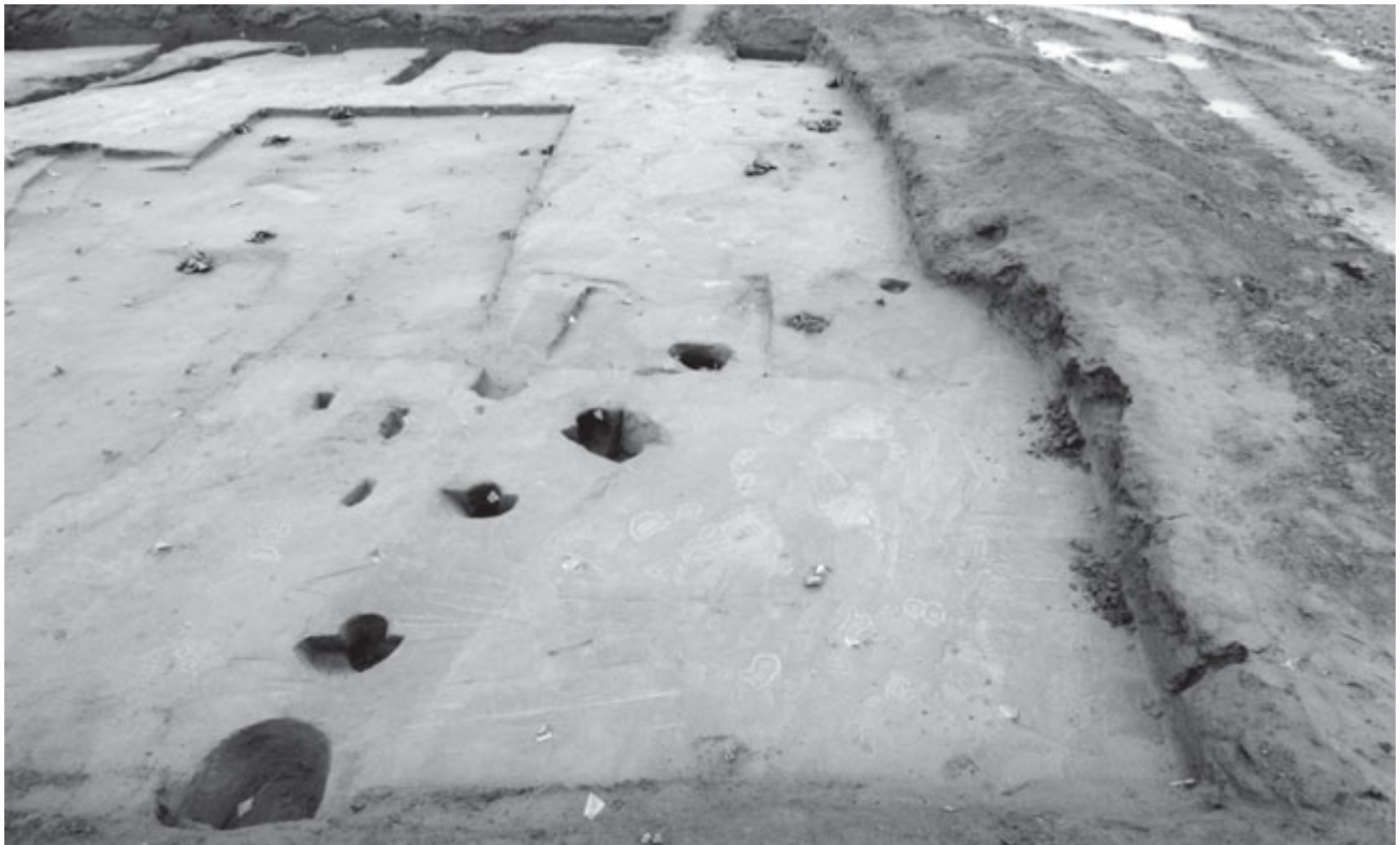
Fig. 4: Postholes of possible Pisgah structure at 38PN1.

investigations conducted during the course of study at 38PN35 included magnetometry, and magnetic susceptibility, which were used to characterize the magnetic signatures of features and strata. Two small blocks, one begun in 2004, measuring 5 X 2 meters and 2 X 2 meters, were opened and hand excavated. The plow zone of approximately 20 centimeters at 38PN35 was shallower than at 38GR1. The average size of the pottery sherds recovered from the surface and plow zone at 38PN35 were also on average four times larger than at 38GR1, indicating less intensive cultivation. But as with 38GR1, Woodland Period components of 38PN35 appear to be confined mainly to the plow zone. Below the plow zone are relatively undisturbed deposits containing a stratified sequence of Archaic Period strata, with a Late Archaic component on top, and a well-defined Middle Archaic component