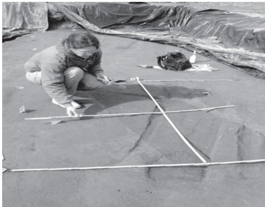
Fig. 3: Fran Knight mapping features at 38GR1.

In the spring of 2005, investigations shifted across the South Saluda River to a terrace site 38PN35. Geoarchaeological investigations, involving ground-penetrating radar and auger testing, were conducted to better understand the landforms on which the site is located and the site formation processes. Other geophysical