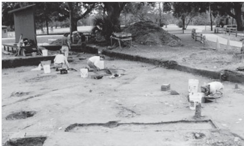
Excavations in the vicinity of the Santa Elena pottery kiln