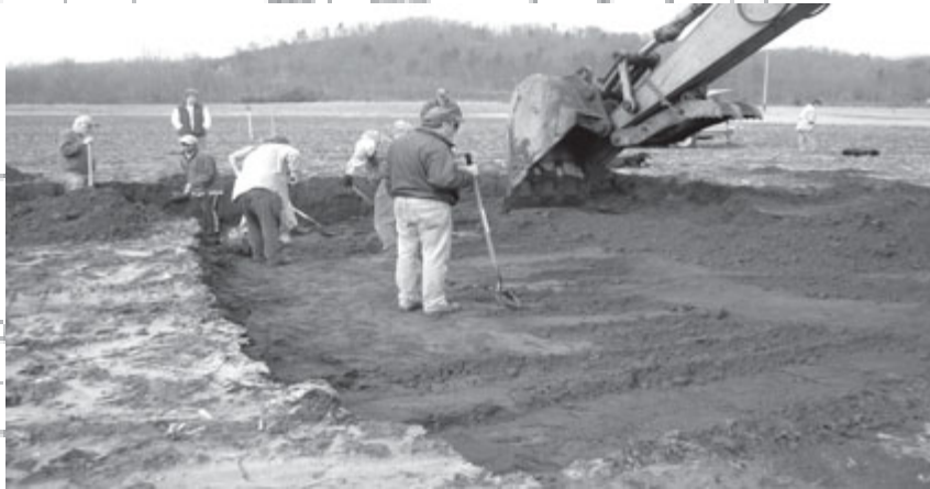
Fig. 2: Removing the plow zone at site 38GR1.

existed. What remained was a number of postholes, oval pits, two possible graves, and a rock-filled hearth that had been dug deep enough by the prehistoric inhabitants to have intruded into lighter colored sediment beneath the area disturbed by the plow zone. In general, the preservation of features at this site is consistent with that exhibited at the Warren Wilson site investigated by Dickens in 1976.