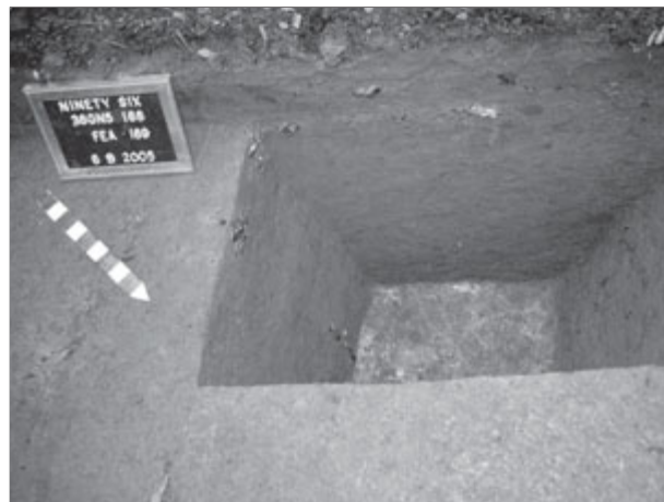
Fig. 3: James Legg's excavated profile of the flèche ditch in Area C.

However, in Area C, Slot 168, we found a 3 X 10 foot trench, Feature 169, which James cut a section through, and found it was three feet deep (Fig. 3). James Legg made a profile drawing of the trench. The profile is like the one illustrated in Diderot's Pictorial Encyclopedia 1763 ([1959] Plate 80) (Fig. 4). At first I thought this feature might be an observation trench for General Greene to keep informed of comings and goings at the southeast corner of the fortifications around the town of