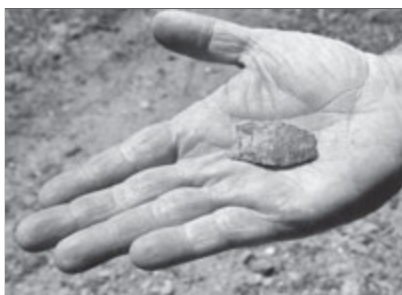
Fig. 2: Clovis projectile point found in Slot 159.

In December 1780, Lt. Henry Haldane inspected Cruger’s stockade and ordered more extensive works, including a star-shaped redoubt on the northeast of the town and a so-called stockade (that archaeology proved to be a stockaded hornwork [Holmes’ Fort] ) on the high ground on the west. These works included the excavation of a 10- to 14-foot wide