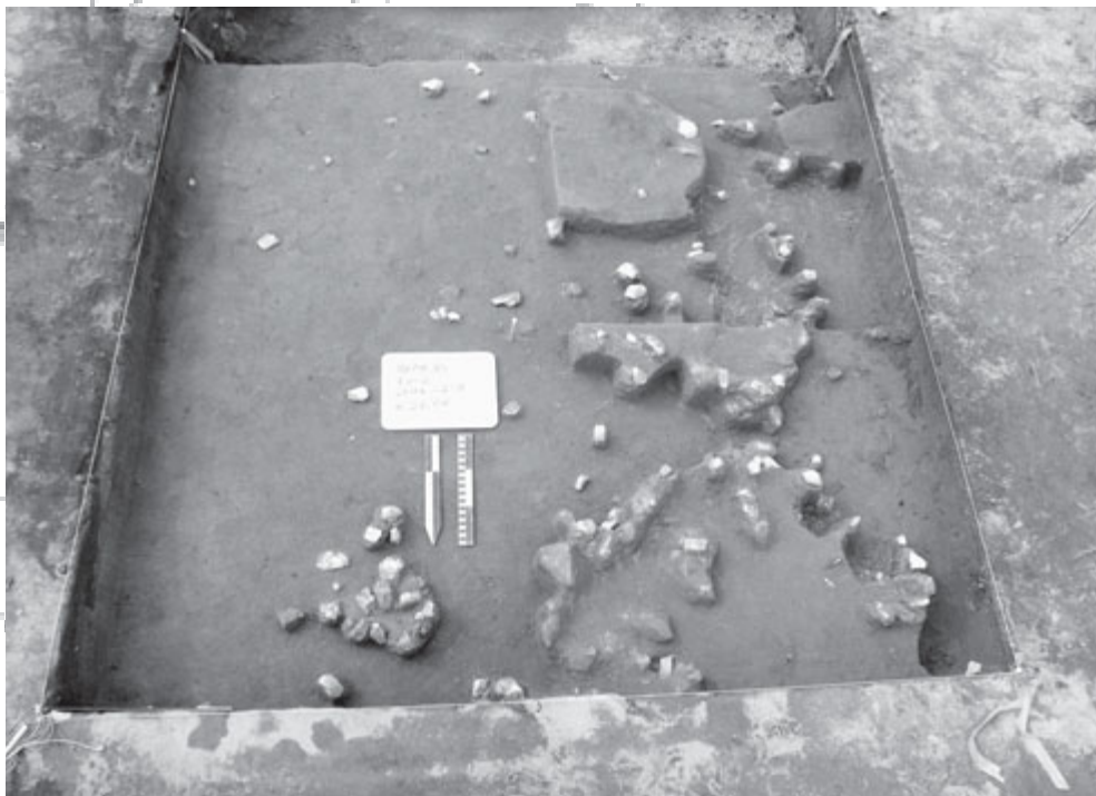
Fig. 6: Late Archaic rock features at site 38PN35.

Piedmont and are a much needed addition to our radiocarbon database and understanding of the areas culture chronology. The two other samples returned conventional radiocarbon ages of 830 +/- 40 BP and 1020 +/- 50 BP, documenting the Late Woodland features, which intruded into the upper Archaic strata. The 1020 +/- 50 BP date derives from a feature containing several segments of carbonized sticks and other plant remains incompletely consumed as fuel.