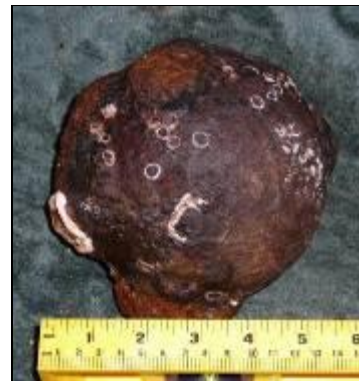
Figure 2 Potential fuse “nodules”

best interest of the finder and artifact. Now begins the long conservation process... Story to be continued in next issue. ■