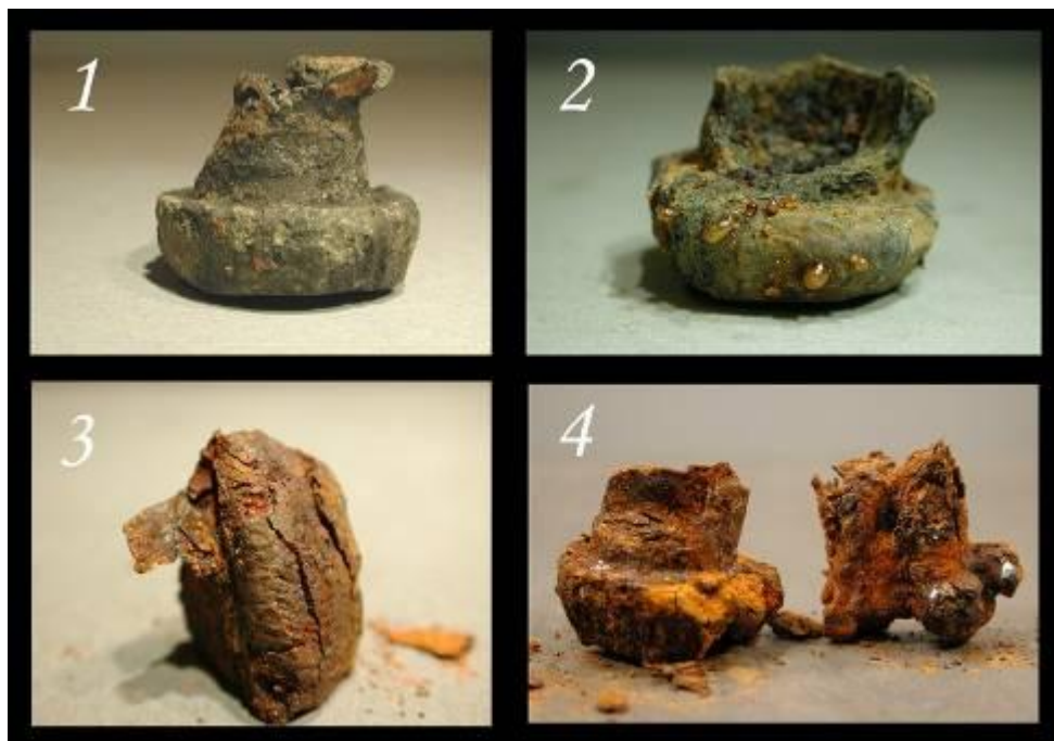
Different stages of corrosion from a recently excavated wrought iron rivet (1) until the total degradation of the iron (4). This corrosion process took only 6 months.

complex and subject to many variables. Once iron has been removed from the marine site the corrosion process will continue and even accelerate unless precautions are taken. ■