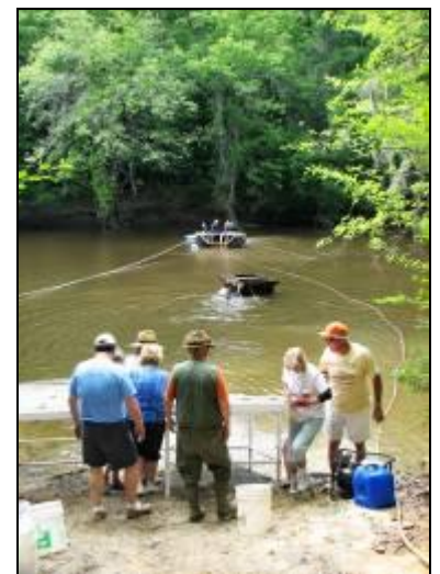
The Allendale Project