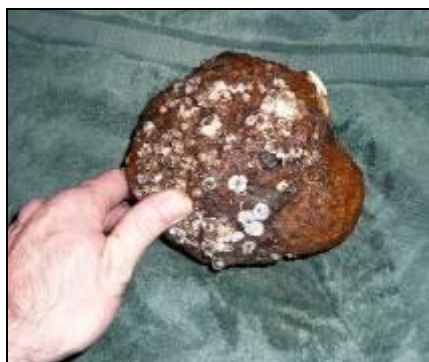
Figure 1 Barnacles and iron concretion