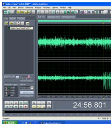
Part of the exhibit in the reading Room that welcomed the Colonial Dames in April, showing one of the stages of digitization.