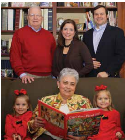
The Wunder Family

In the Smith and Wunder families , generosity is a stalwart legacy passed from generation to generation. Their most recent gifts reside in the Irvin Department of Rare Books and Special Collections in the Hollings Library.