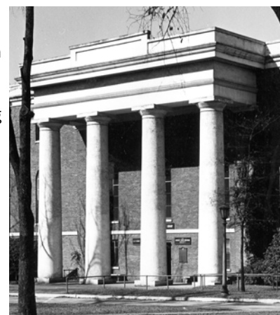
Located on the historic Horseshoe of the University of South Carolina, the Oral History Program at the South Caroliniana Library gathers interviews of South Carolinians from all walks of life.

At the Caroliniana, our recordings begin in the 1930s and span more than a thousand hours of interviews in a variety of formats, from microcassettes to reels. We are currently building a database to catalog them and a digital workstation to ensure their preservation (see p.6 for details). In keeping with the Library's mission to document the lives of all South Carolinians, our oral histories encompass a wide array of narra-