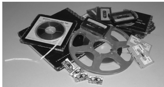
Tapes donated to the Library come in all formats. These recent arrivals include several sizes of reels, cassettes, and microcassettes. All of them will have to be transferred to digital media.