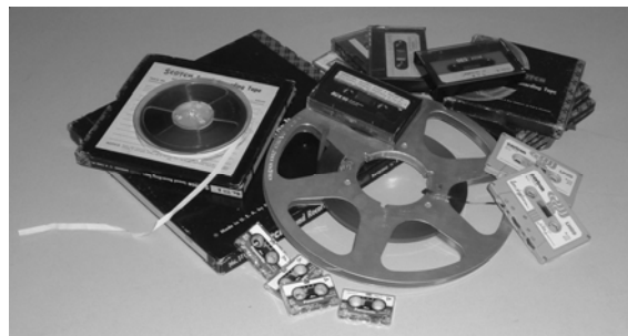
Tapes donated to the Library come in all formats. These recent arrivals include several sizes of reels, cassettes, and microcassettes. All of them will have to be transferred to digital media.