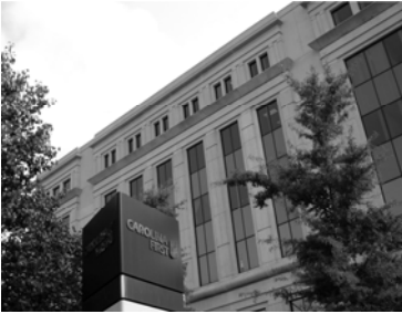
The eye-catching façade of the Columbia headquarters of Carolina First.