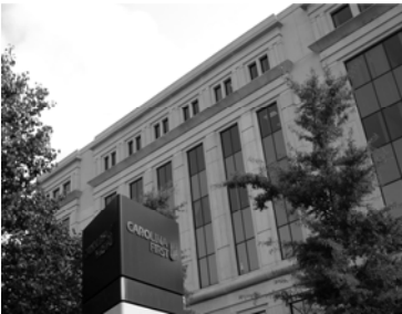
The eye-catching façade of the Columbia headquarters of Carolina First.