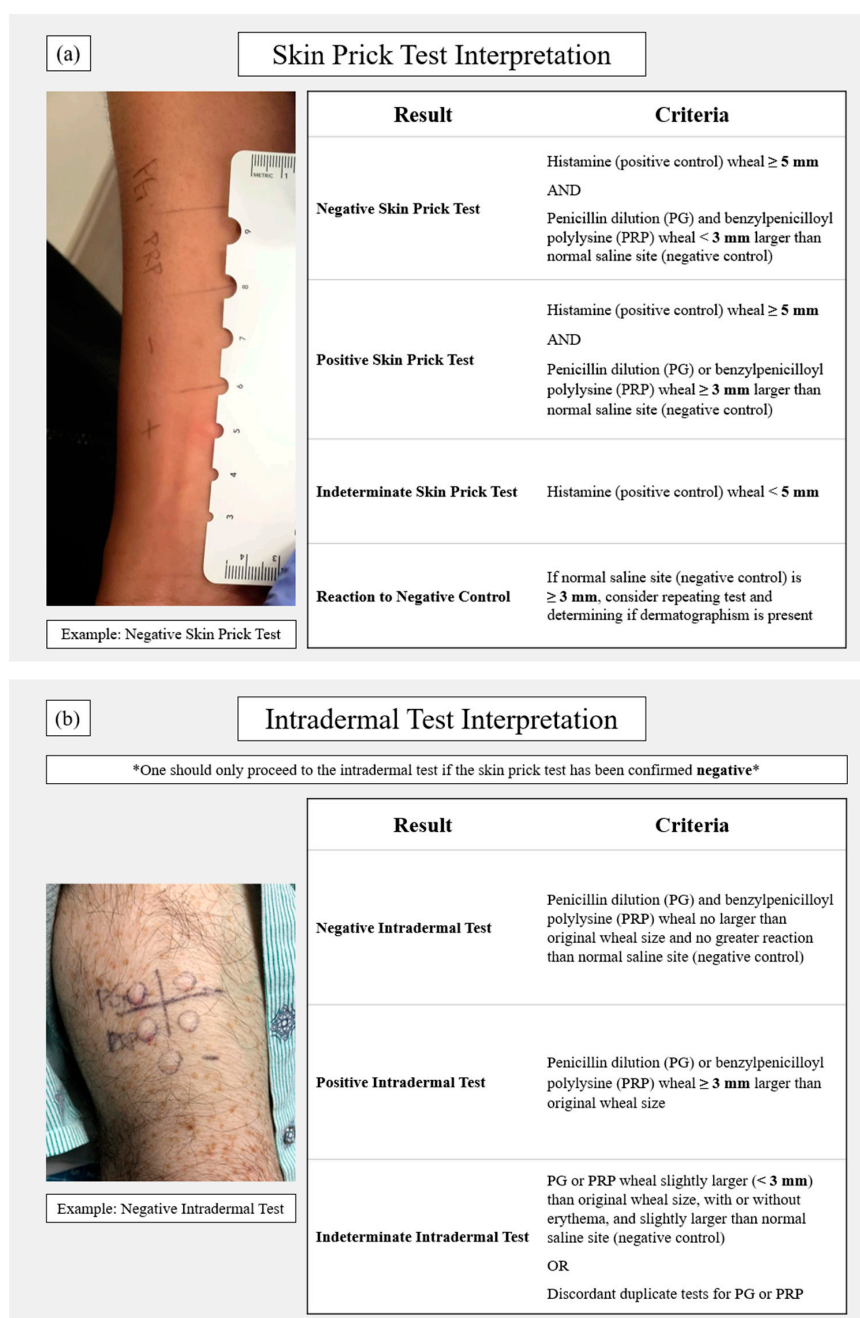
Figure 1. Penicillin skin testing procedure including (a) step 1 of the skin prick test and (b) step 2 as the intradermal test with associated interpretation thresholds for each.

a 15–20-min waiting period. A negative prick test means the patient has a positive reaction to the histamine and a negative reaction to the other three components. Because histamine is used as the positive control, any histamine H1 receptor antagonists (e.g., diphenhydramine, hydroxyzine) should be avoided for at least 48 h prior to the test. Recent ingestion of antihistamines is often the reason for a non-reactive or indeterminate test (i.e., <5 mm reaction to the histamine). Many centers also suspend other medications with antihistaminic properties prior to the test when possible, such as tricyclic antidepressants (e.g., amitriptyline, nortriptyline) and atypical antipsychotics (e.g., aripiprazole, olanzapine, quetiapine) [23]. Patients receiving non-selective beta-blockers may also be excluded from some protocols or require consultation with an allergist prior to PST. The intradermal test should only be conducted following a negative reaction to the skin prick test [11].