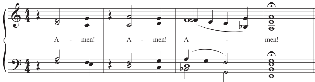
Example 3.2, Discovery and Praises , Movement 4, mm. 174-177 Copyright 1986 by E. C. Schirmer Music Company, a division of ECS Publishing, Boston, MA. Used by permission

Some of the melodic characteristics common in Susa’s choral works include wide ranges for all parts, use of repeated notes, avoidance of melodic repetition, and use of melismatic writing as a word-painting device. In Discovery and Praises , he sets the text mostly in syllabic and neumatic constructions. While he uses conjunct melodic movement, he also moves in perfect intervals, thirds, sixths, and sevenths. 17 The larger leaps give a disjunct quality to the melodic lines, especially in the third movement that