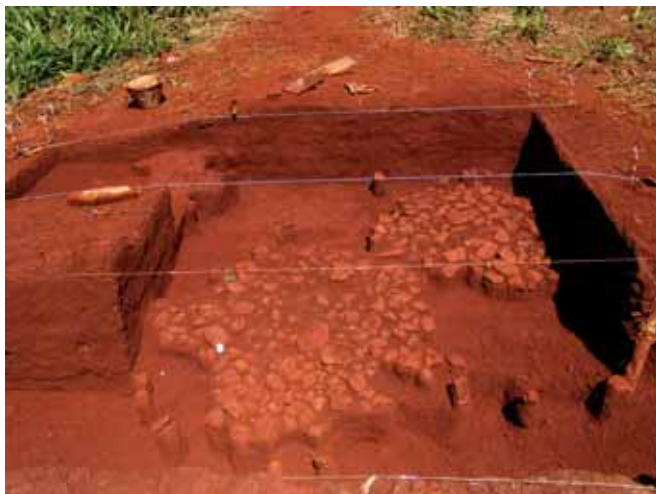
Fig. 2: Stone features at the base of the mounded ring surrounding the central mound.