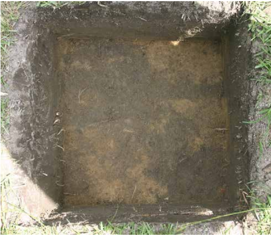
Fig. 3: Post mold in bottom right corner of shovel test at House Lot No. 11.