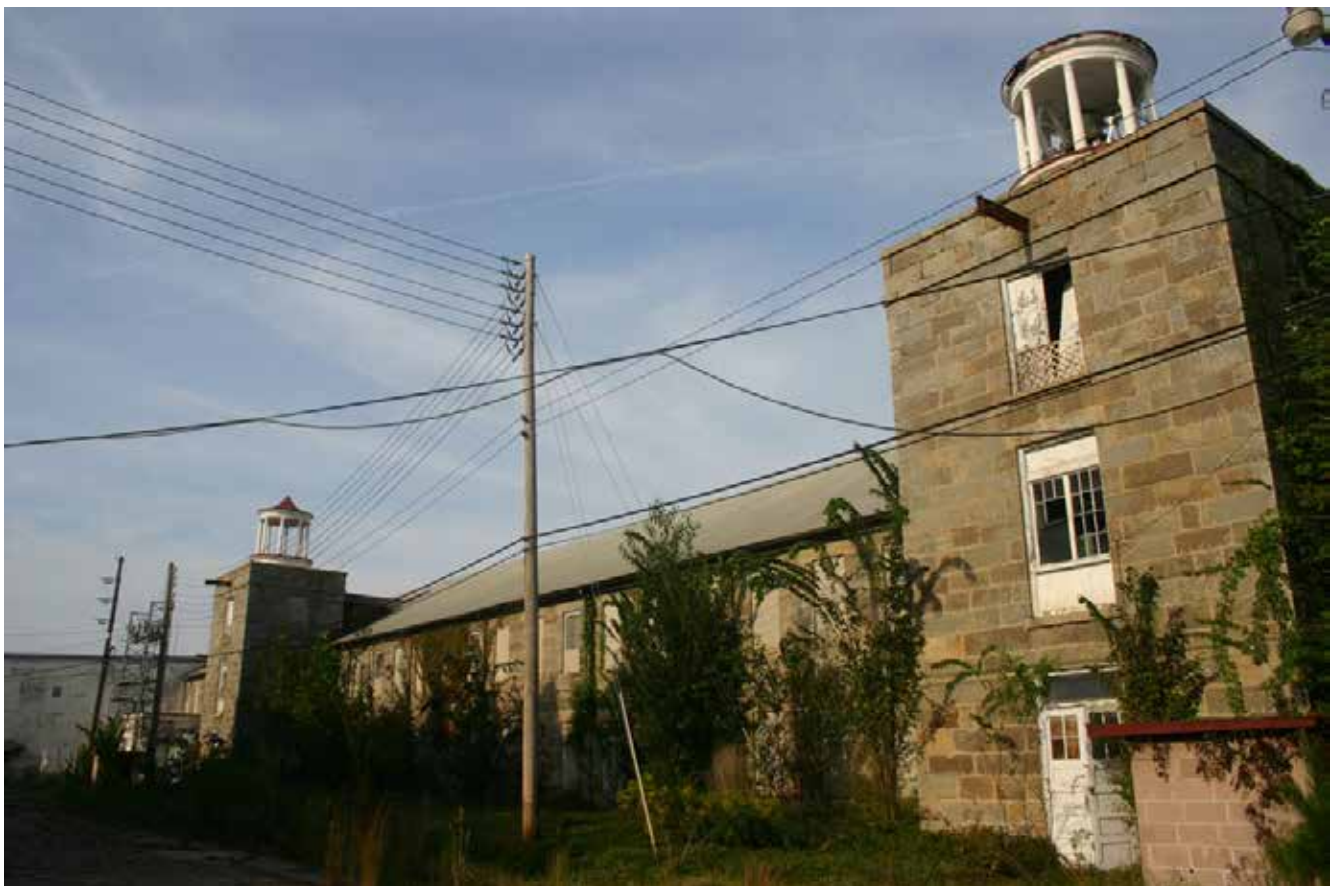
Fig. 5: The historic Graniteville Mill designed and built by William Gregg was constructed between 1846 and 1848.