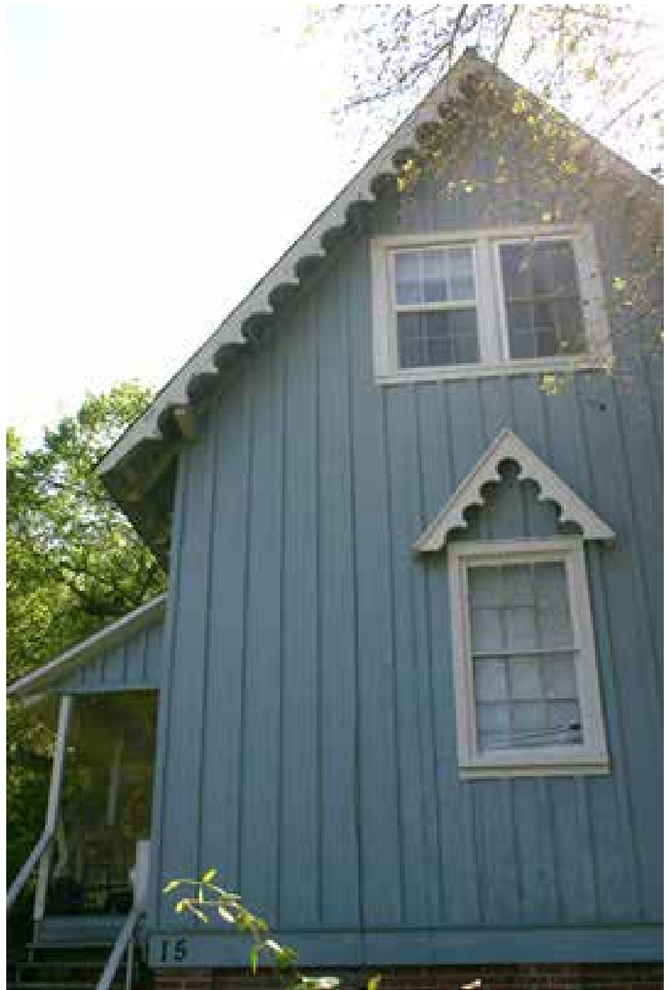
Fig. 2: Gothic Revival Style cottage constructed ca. 1846 at House Lot No. 15.

Surviving archival records from the mill contain little about the everyday lives of the workers. Archaeology as a materialist science is particularly well suited to address the issue regarding the daily life of mill operatives and their families. Since the Graniteville Company was in operation until 2006, no archaeology has ever been conducted at Graniteville to reveal the contextual