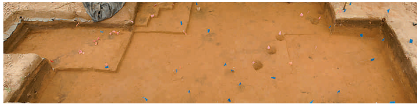
Fig. 1: December 2011 Excavation Unit at 38PN35 showing palisade line to the left and possible line of structural posts to right.

Excavations were conducted at Robertson Farm Site 2 (38PN35) from May 22-June 11, and December 12-29, 2011. The investigations in 2011 had two research objectives. One objective was to further examine the Mississippian (Pisgah) and Middle Woodland (Connestee) components of 38PN35. A number of new prehistoric features were exposed and mapped. The majority of these features were postholes. A few pit features were also exposed, including two large Connestee storage pits and an earth oven. Investigations to delineate withinsite settlement patterning of structures and storage features are on going. An