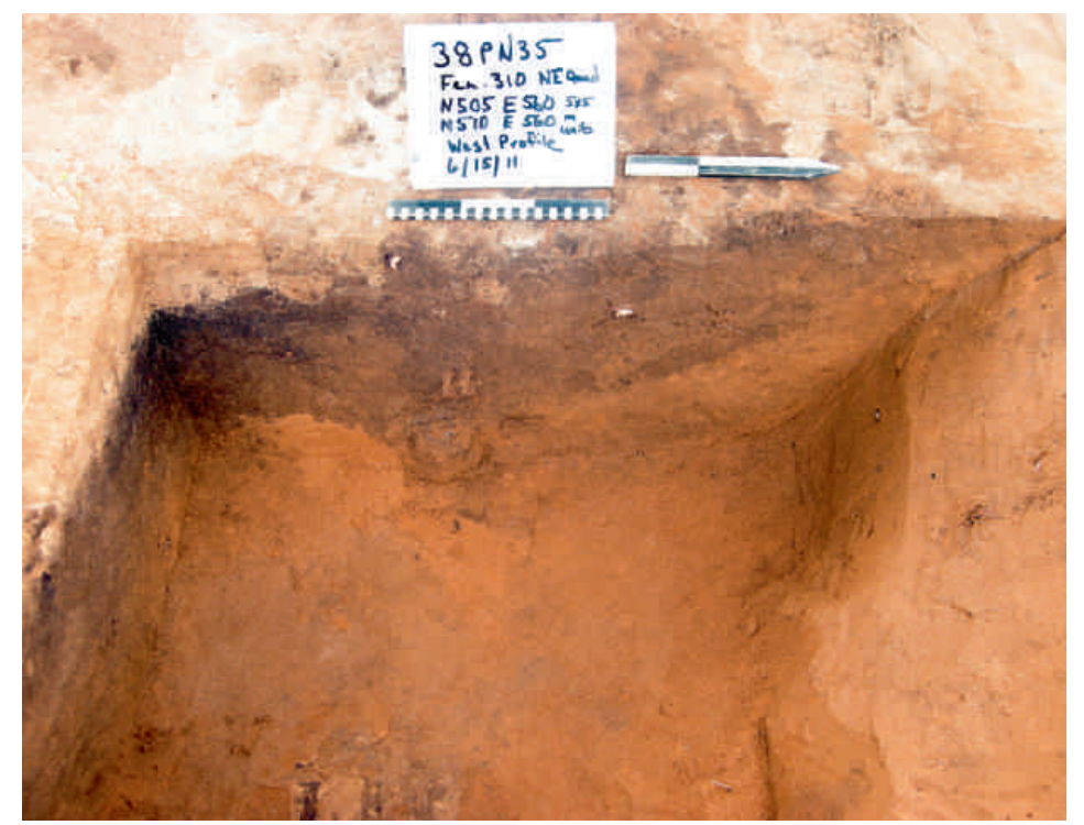
Fig. 2: 38PN35—Feature 310—large stratified Middle Woodland storage pit with NE quadrant excavated.

attempt was also made to more clearly define and date a previously identified palisade. Artifacts larger than one squareinch were piece plotted, and flotation and carbon samples, when present, were obtained from all excavated features. Pisgah features radiocarbon dated this year include a palisade post with an age of 2 Sigma Cal AD 1,320 to 1,430 (Cal BP 630 to 520) and pit feature with an age of 2 Sigma Cal AD 1,160 to 1,220 (Cal BP 790 to 690). Charcoal from a small pit feature, originally thought to be a post but containing two small ground and polished gaming stones, excavated in 2009, was dated at 2 Sigma Cal AD 880 to