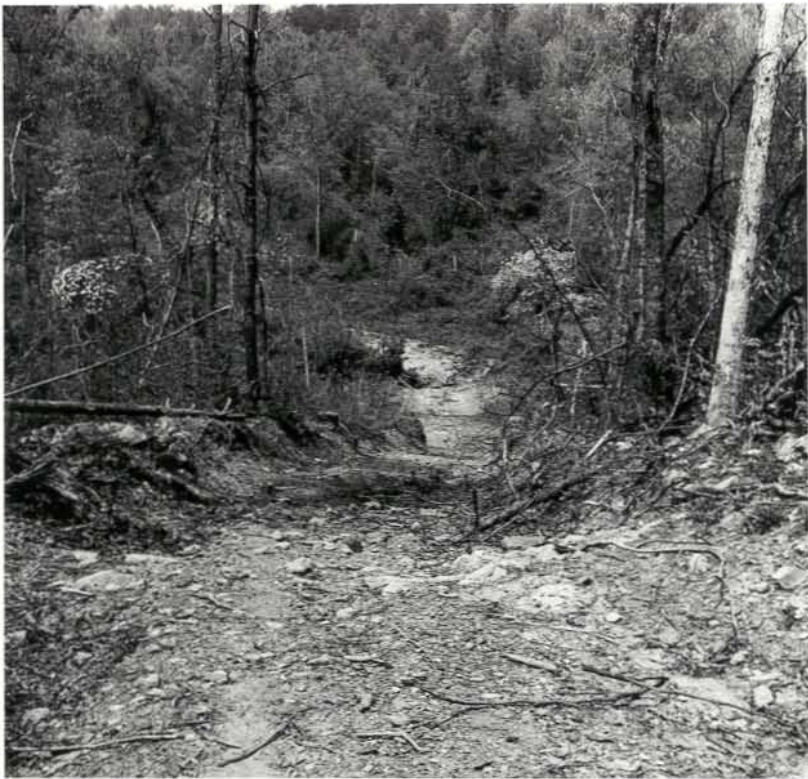
FIGURE 2. Heavily Eroded Section of Road Typical of Much of Survey Area.