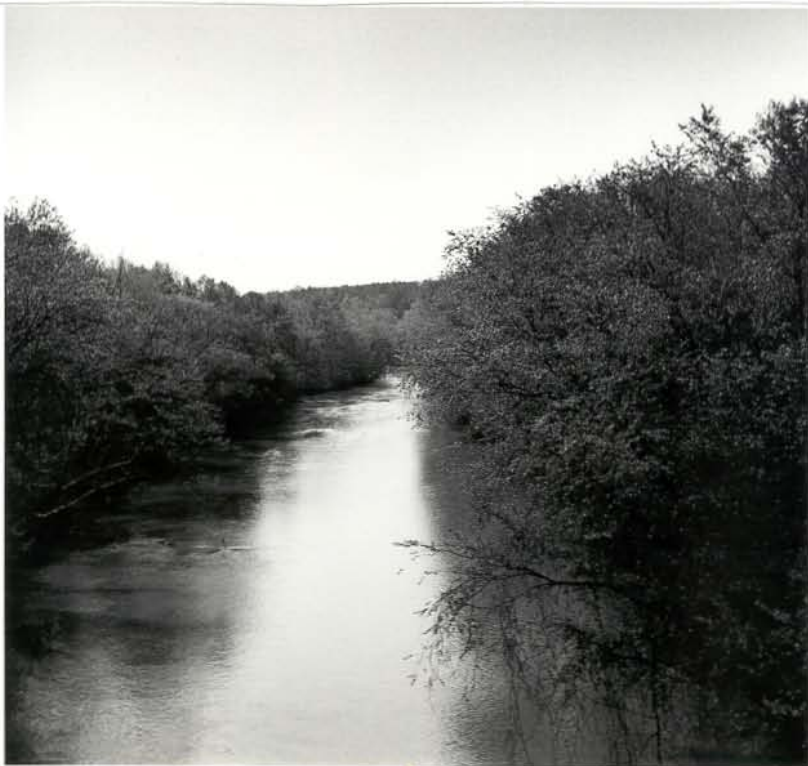
FIGURE 3. The Pacolet River