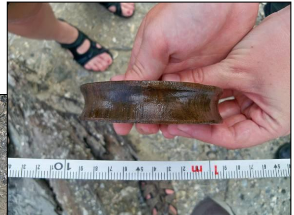
Hilton Head wreck sheave profile