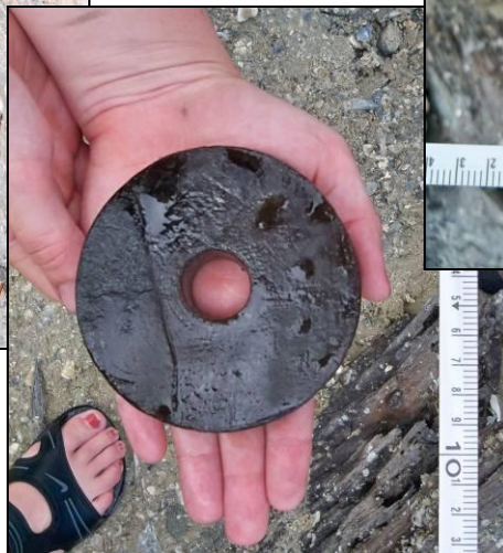
Hilton Head wreck sheave just after recovery