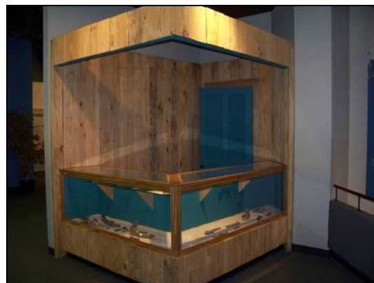
Future Hobby Diver Program exhibit space at the SC State Museum