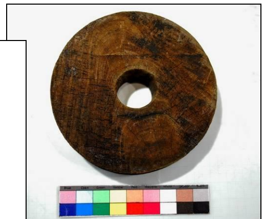
Picture taken during drying. The same cracks are more apparent now that the wood began drying.