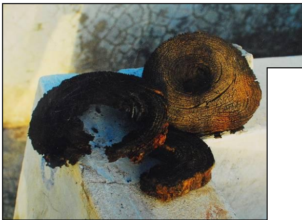
Port Royal wood. Lignum Vitae recovered from a wreck from Port Royal that did not receive any kind of conservation. Note the extensive cracking and collapsed surface.