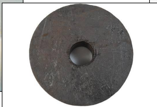
Picture taken before conservation. Note the cracks on the right side of the image, as well as some on the left, are not that obvious as the coloring of the wood is very dark.