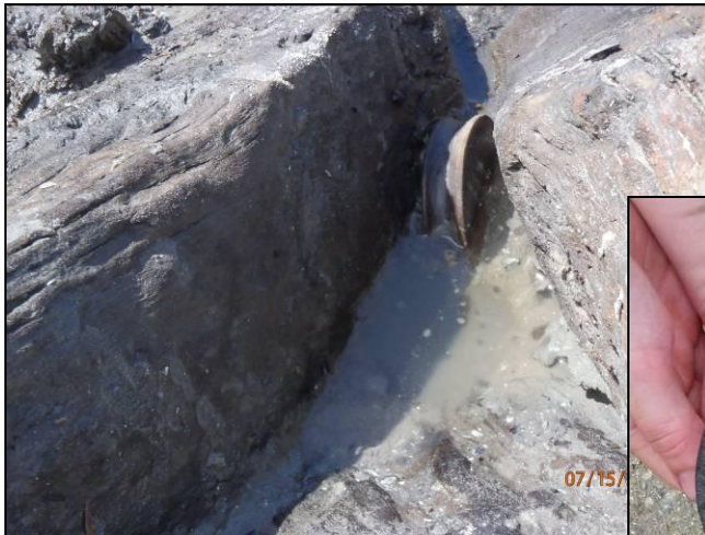
Hilton Head wreck sheave in situ

the treatment has gone well but it's impossible to determine when it will be finished. Only the artifact will let us know when it's ready.■