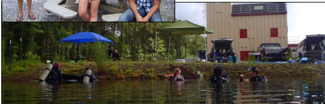
Below: FTC students at the Mt. Pleasant Fire Department training pond