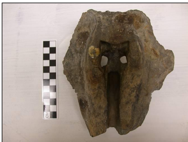
Donated Dolphin Skull