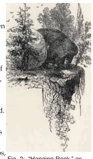
Fig. 2: "Hanging Rock," as depicted by Benson Lossing in 1849.

By this time, however. Sumter's mer were nearly exhausted, and were almost out of ammunition, including what they had captured. Many had left the ranks to loot the enemy camps and some had made