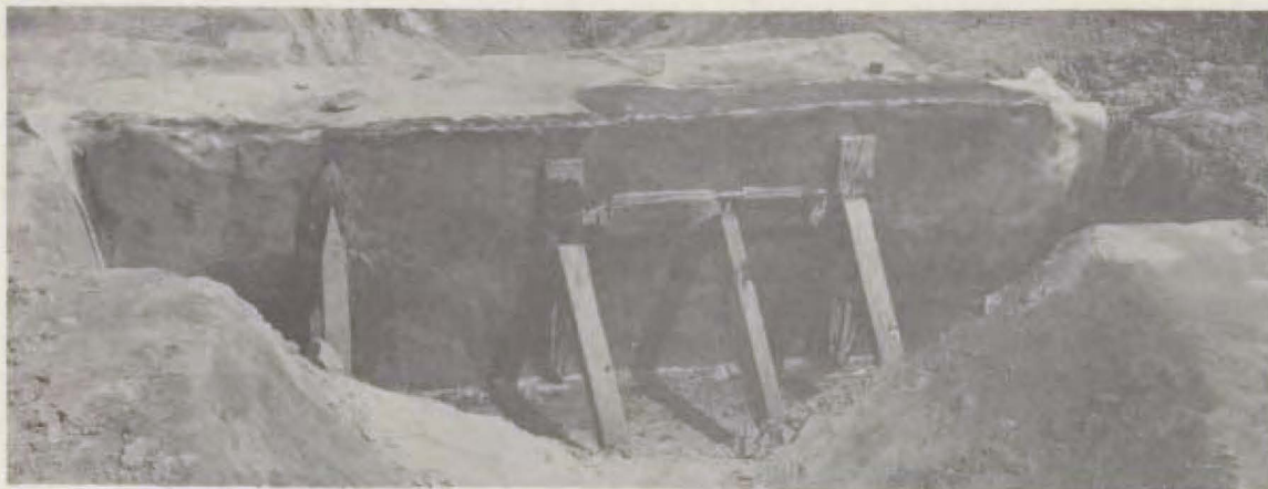
Fig. 2. Fiberglass Resin Applied to a Profile with Stakes Used as Supports