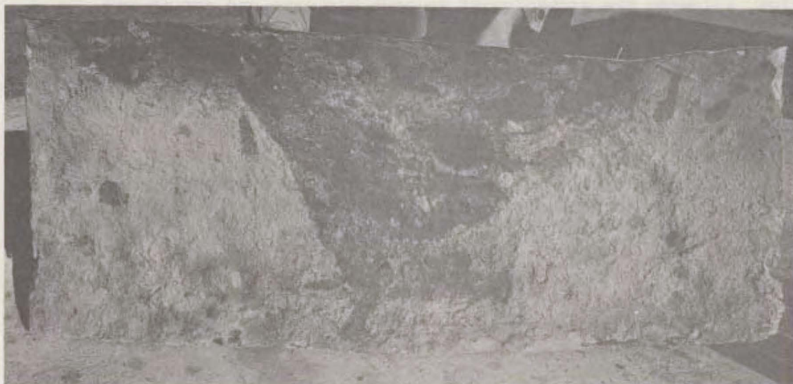
Fig. 3. Lifted Profile for Use as Data, Teaching Aid, or Exhibit Purposes