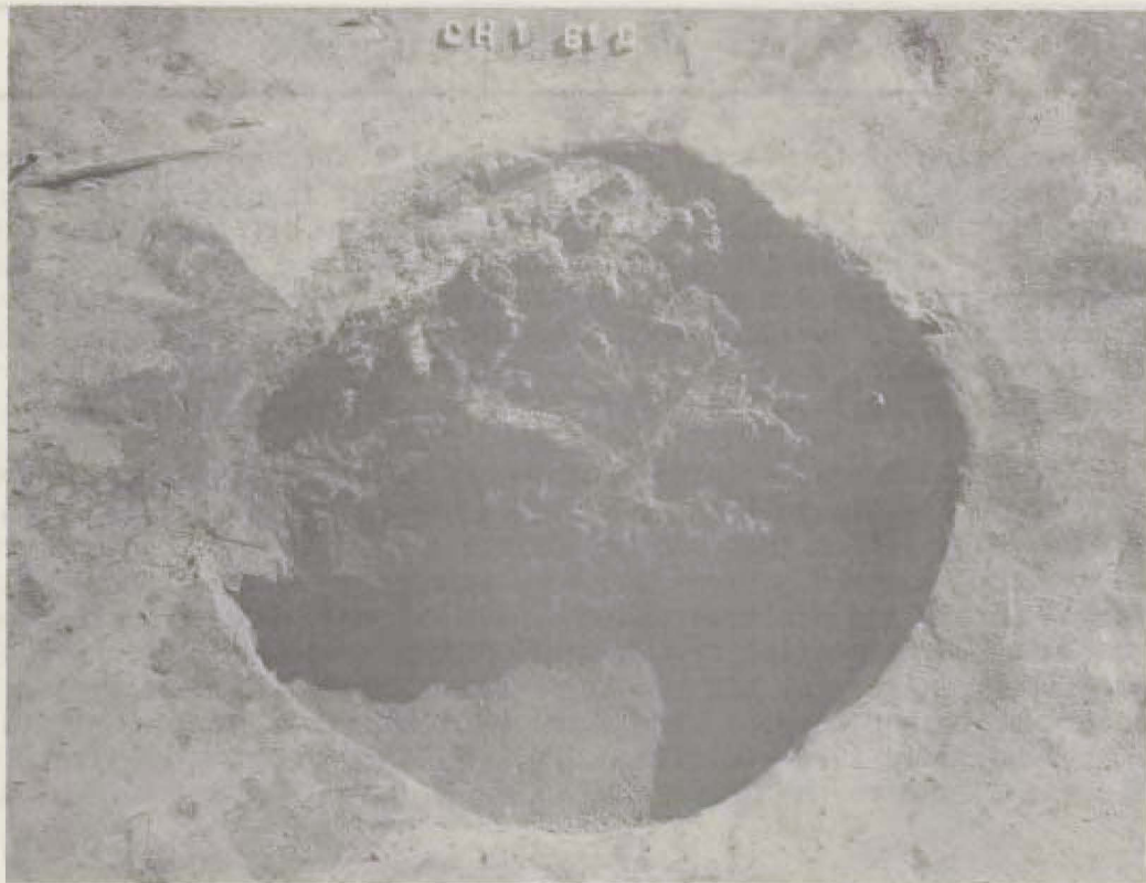
Fig. 4. Sectioned Corncob Pit Before Treatment with Polyurethane Resin for Removal