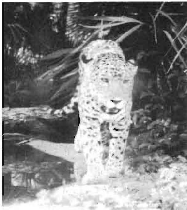
Jaguar at the Belize Zoo