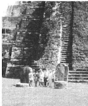
Group in Grand Plaza at Tikal