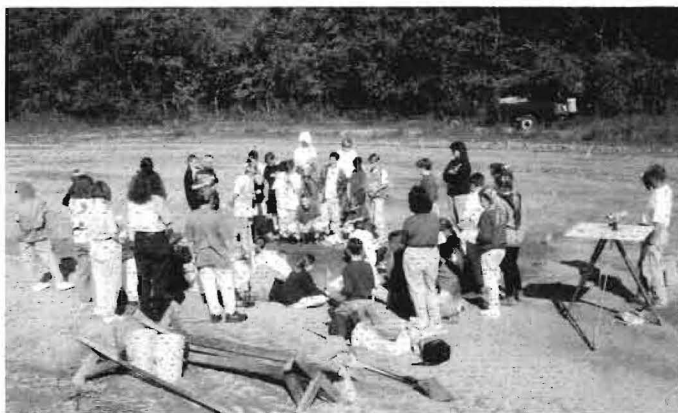
Meyer Brothers Farm (38AK615) Excavation Techniques Explained to School Group from Kennedy Middle School