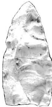
Paleoindian Fluted Preform Found At The Big Pine Tree Site

Our latest attempts to isolate Paleoindian remains have focused on a highly unusual site located on Sandoz Chemical Corporation land in Allendale County. This site has been known about since 1983, and in 1985 it was nominated along with several other chert quarries located on Sandoz property to the National Register of Historic Places as part of the Allendale Chert Quarries District. In 1992, Sandoz excavated a boat slip in the bank of the site which is situated along Smiths Lake Creek. This fortuitously revealed a nicely buried stratified prehistoric site with deeper deposits than previously had been known. Controlled backhoe trenching by our team subsequently revealed Paleoindian lithic