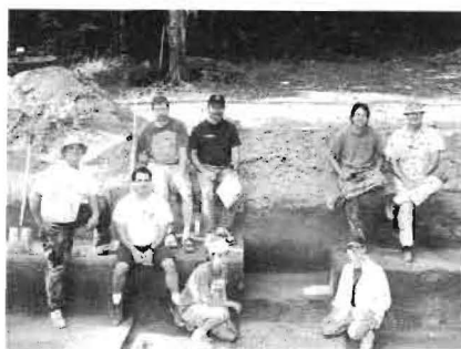
Crew Excavating At The Big Pine Tree Site

Funds are currently needed to obtain radiocarbon dates for the Paleoindian level and the MALA midden, and for paleoethnobotanical analysis of the charred plant remains.