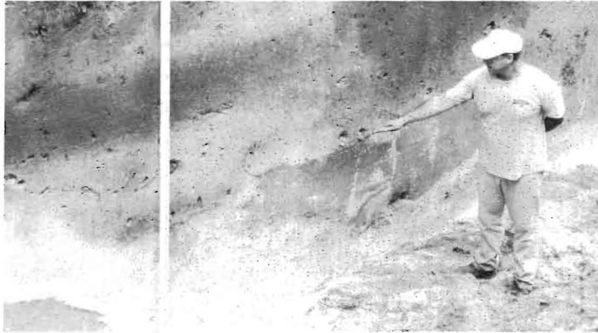
Al Goodyear Pointing To Paleoindian At The Big Pine Tree Site

classified the MALA as a Bw/Apaleosol. Apparently, there was a long period of landscape stability where a B horizon began to form over a former A horizon surface. Much of the dark color of the horizon is attributable to quantities of wood charcoal and