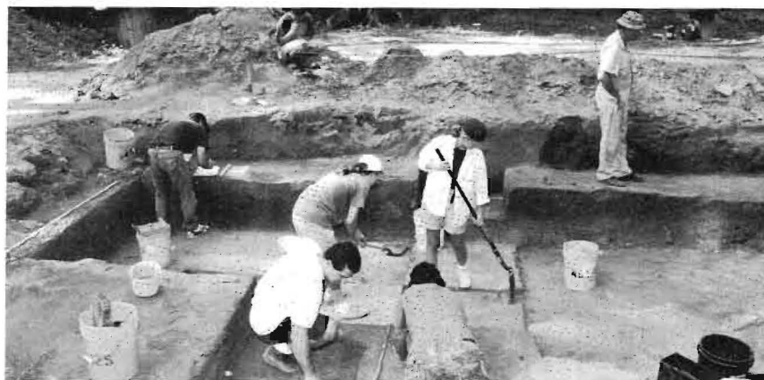
1995 Excavation Team At The Big Pine Tree Site