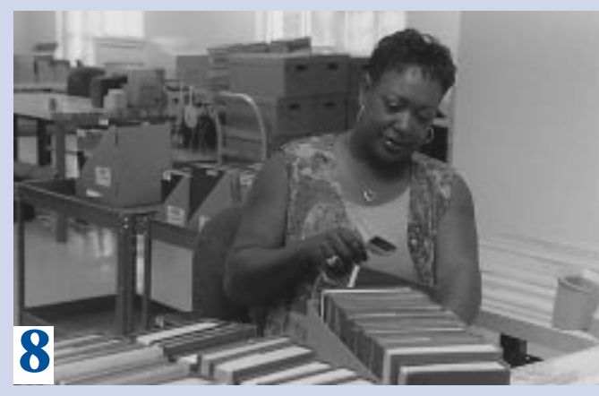
Just as each book is assigned a unique barcode, so is each tray. The barcodes of the books within each tray are scanned into the computer in association with that tray, and that tray only, during the accession stage of the procedure.