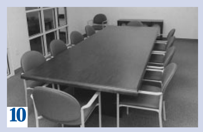
The annex contains a conference room and two study rooms for patrons who wish to do their research on site.