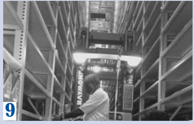
The final step to storage takes place when the tray of books is given an address on one of the 9,800 shelves of the storage area. The annex has a lift called a Raymond which can reach shelves 38 feet bove the floor.