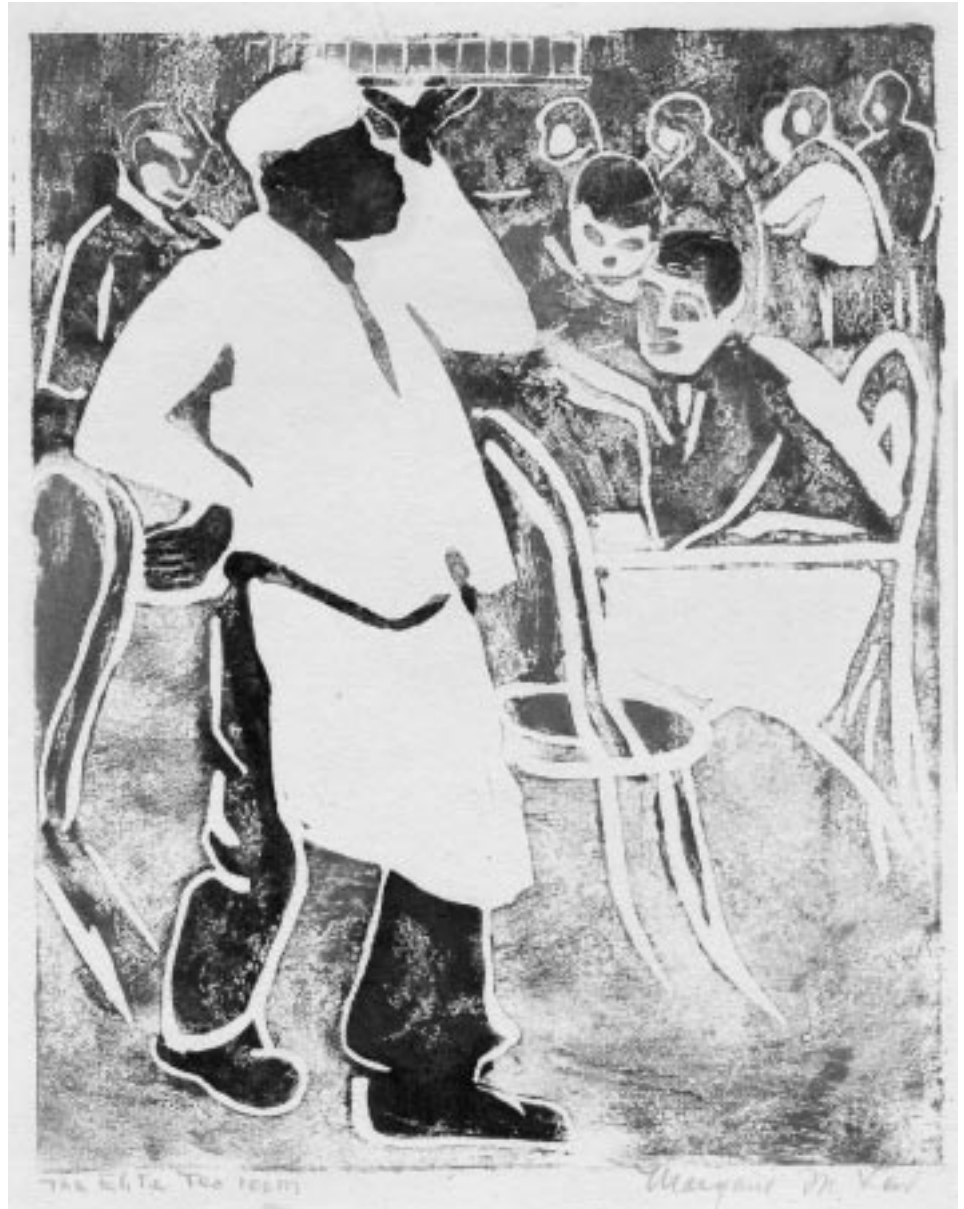
"The Elite Tea Room," a color woodblock print on paper