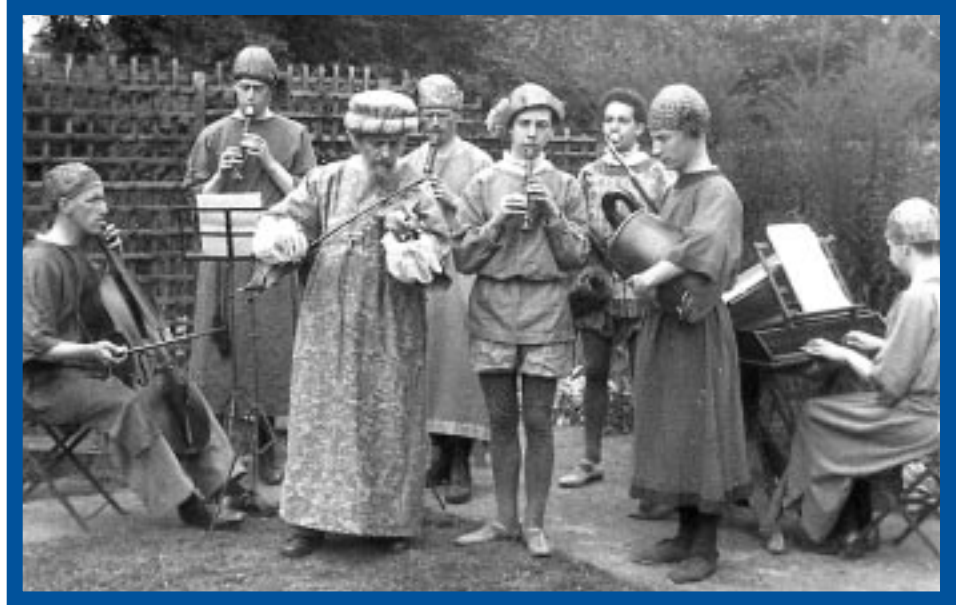
The Dolmetsch Consort (left to right)—cello, soprano recorder, rebec, alto recorder, soprano recorder, serpent, drum, and spinet

The instruments required to perform European music of the Middle Ages, Renaissance and baroque periods were little known in the early part of this century and were no doubt amusing stuff for the Movietone photographer. Arnold Dolmetsch, who was born in Le Mans, France in 1858 and died in England in 1940, was schooled in late Victorian academia which saw "survival of the fittest" as a universal principle: old music and old instruments, like old animal species, would always be replaced by the new and possibly improved. Despite these prevailing views,