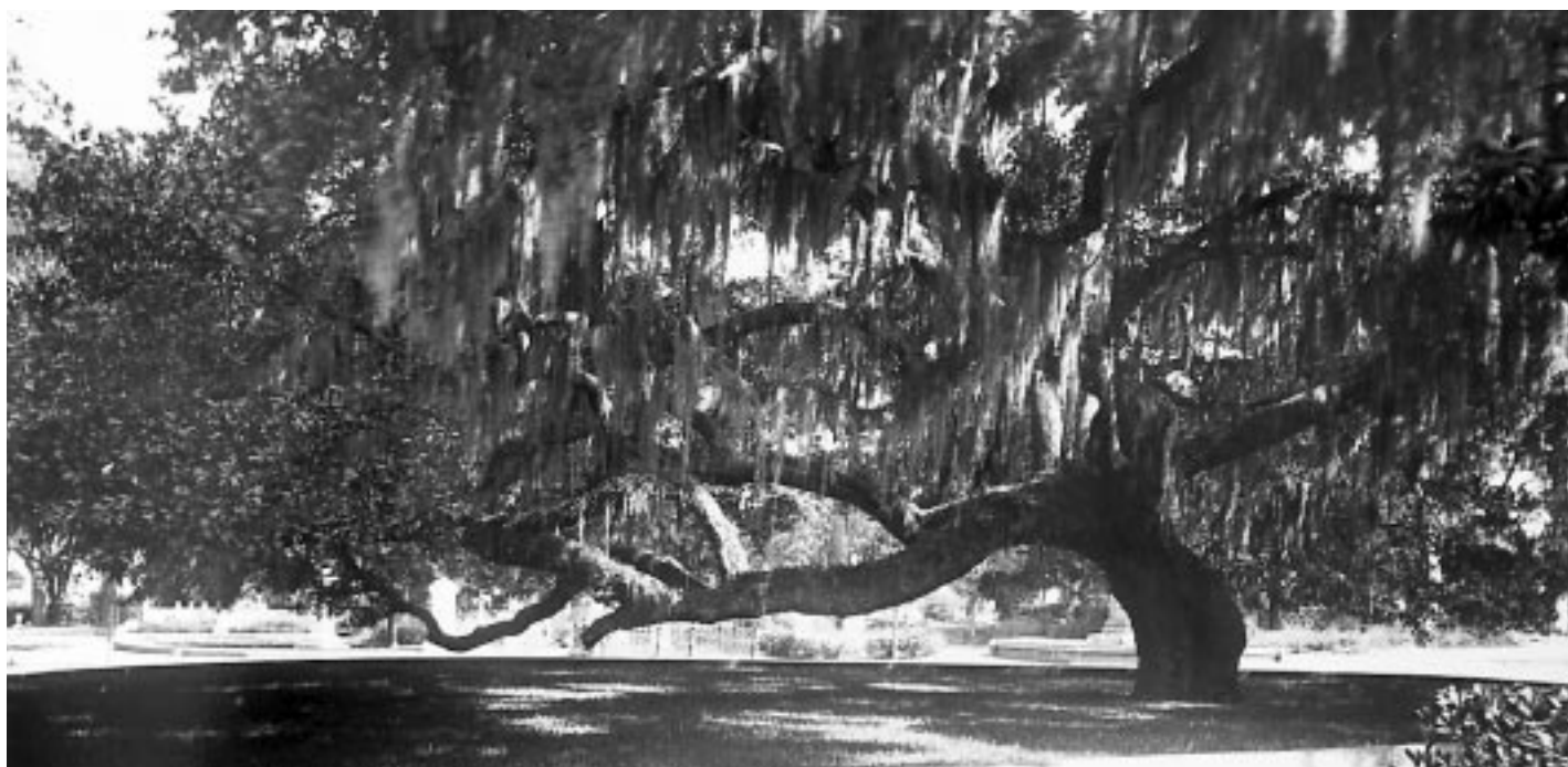
Live oak with Spanish moss