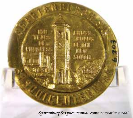
Spartanburg Sesquicentennial commemorative medal