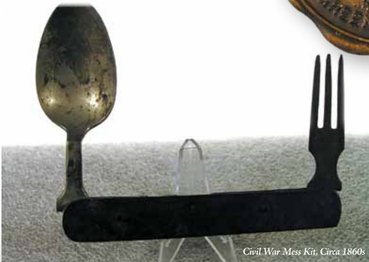
Civil War Mess Kit, Circa 1860s