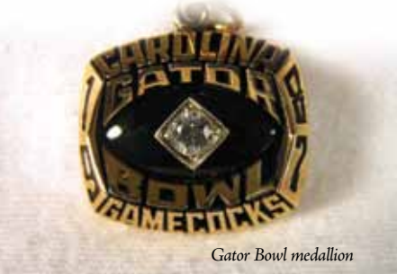
Gator Bowl medallion