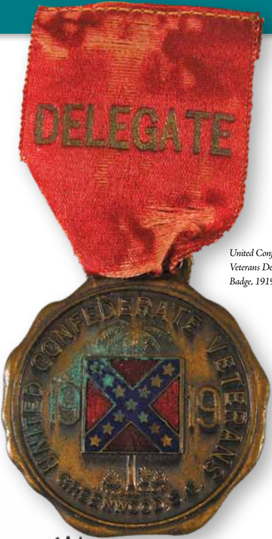
United Confederate Veterans Delegate Badge, 1919

Juxtaposing the words “mettle” and “metal,” McKissick curators have mined the collection for a cross-section of metal objects that symbolize a person’s character. Showing Your Mettle invites visitors to see some of the museum’s hidden treasures while also considering how these objects are tied to a person’s identity. Featured objects include a Civil War mess kit, silver tea canister, dueling pistols, ceremonial swords, political memorabilia, coinage, awards, and medals cast in gold, silver, bronze and brass. The exhibition raises questions like “What kind of people owned or used these objects?” and “What do they say about the individual?” Visitors are encouraged to leave comments as to how they show their mettle, whether it be through materials collected for personal adornment or visual display.