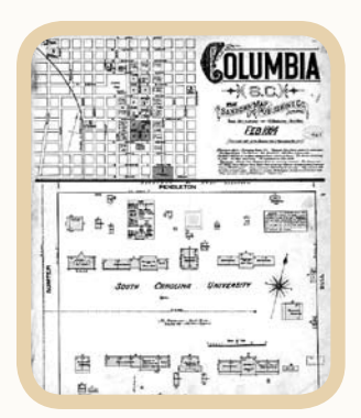
Sanborn Fire Insurance Map showing USC Horseshoe

The Digital Activities Center, which has been in operation for about a year, has created a total of six online databases of unique materials from the University Libraries' special collections. The collections are available to researchers worldwide at www.sc.edu/library/digital.