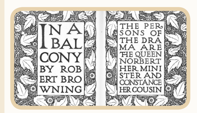
In a Balcony by Robert Browning issued by Blue Sky Press of Chicago in 1902

The Walton collection includes over 250 limited-edition books, pamphlets, and broadsides from contemporary fine presses, together with a collection of leaves from illuminated manuscripts and early printed books, and ephemera from many presses.