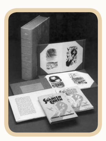
Items from The Spanish Earth archive

The printer's archive for Ernest Hemingway's The Spanish Earth (1936) has recently been acquired for Thomas Cooper Library's Speiser and Easterling-Hallman Collection of Ernest Hemingway. The author wrote and narrated the commentary, first published in this book, for a pro-Republican Spanish Civil War film. The archive, which includes original illustrative artwork, was