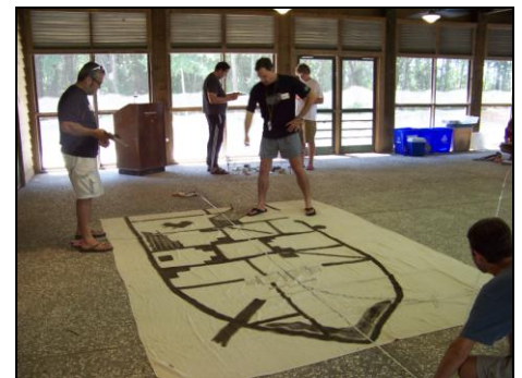
2011 FTC recording a mock wreck