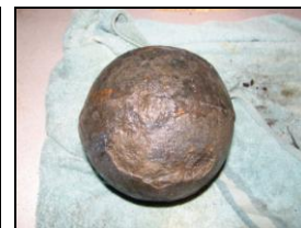
After 7-month cleaning