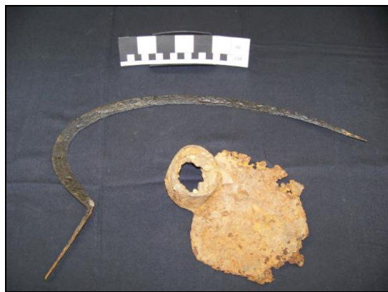
A properly conserved rice hook and an improperly conserved hoe

Note: When retrieving artifacts, make sure you are up to date with your Hobby Diver License and that you document and report the findings in an appropriate manner.■