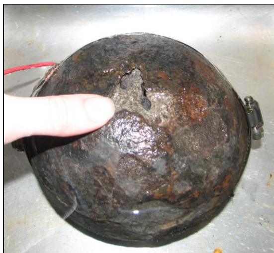
Figure 1 Vampire bite soft spots