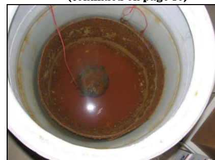
Figure 3 New steel anode ring and rust build up after a 3-month period of electrolysis