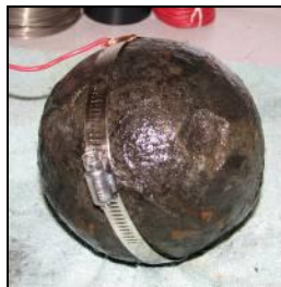
After 1-month cleaning