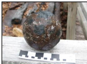
After initially corrosion removed