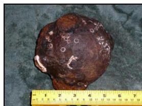
Cannonball immediately after brought up

the copper wire and the clips. The hose clamp was rotated about 45°. I kept the steel plates the same as they still had enough good metal to use. We may have to change these in the middle of the next three months if it looks like we are not getting a good connection any longer... Read more about the conservation process in the next issue. ■