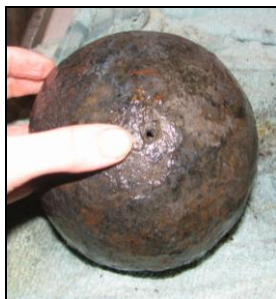
Figure 4 New soft spot at 7 months

during this cleaning phase. I first rinsed the ball in fresh water to remove the thin black film that forms on the ball during the process.