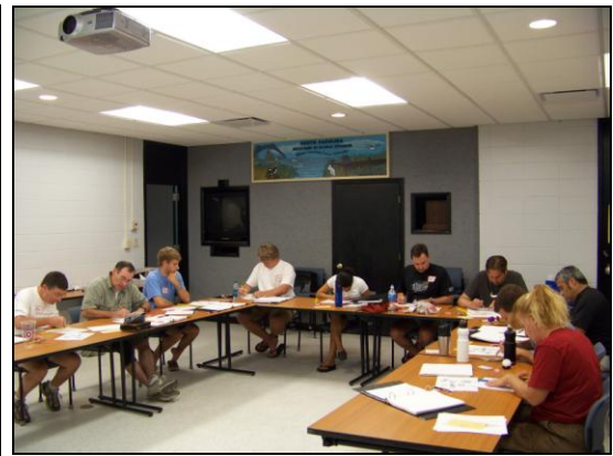
Students in the classroom