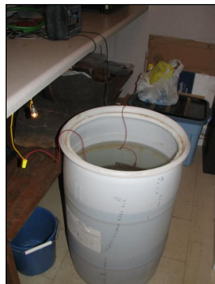
Figure 2 Our new, non-leaking 30-gallon drum

Over the following three months, the amount of corrosion off the ball significantly decreased. The steel plates held up well as did the clips (Figure 3). This leads me to believe that the iron of the cannonball is becoming more stable. I made sure to check in on the set up at least once a week to make sure all of the wires and clips were still attached and it was still running happily at ½ an amp. Thanks to the new white plastic drum, I could really see the ball in the solution to monitor its progress. The sodium carbonate and water solution should remain clear during the electrolysis process. If at any time