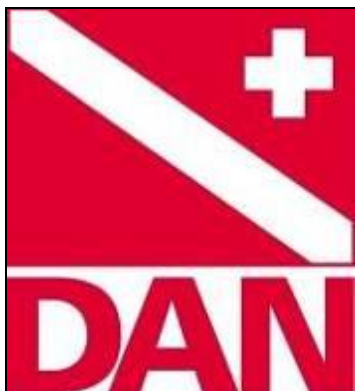
The Divers Alert Network

For more information on DAN visit: www.DAN.org ■