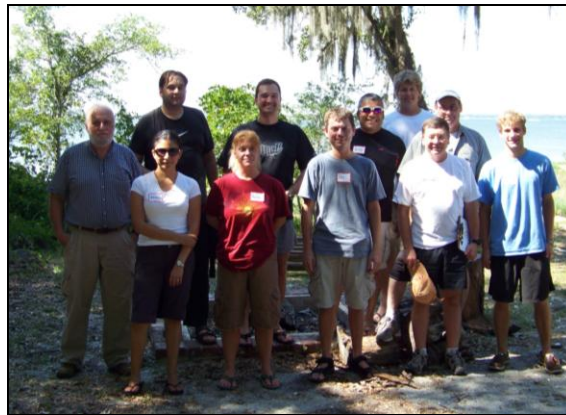
2011 FTC students