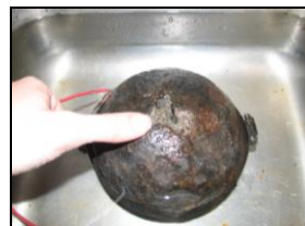
After 4-month cleaning