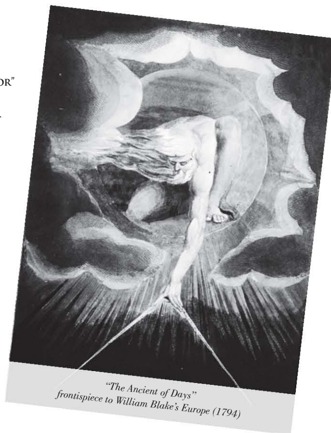
"The Ancient of Days" frontispiece to William Blake's Europe (1794)