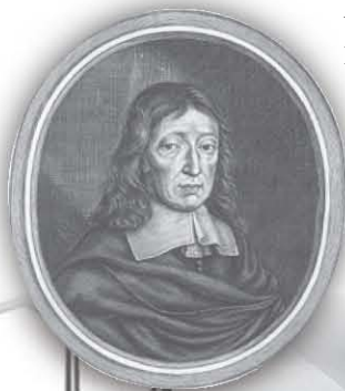
Frontispiece from Milton's History of Britain (1670)