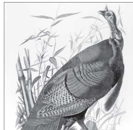
“American Wild Turkey”