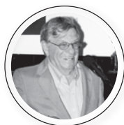
William Price Fox

AMERICAN WRITER and humorist William Price Fox gave a talk and read from his latest book, Satchel Paige's America , at an event held in April at the South Caroliniana Library. The event was sponsored by the Thomas Cooper Society.