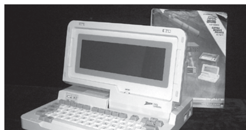
The Zenith Data Systems laptop computer with its manual.