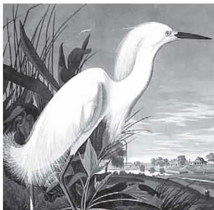
“Snowy Heron,” with a South Carolina rice plantation in the background