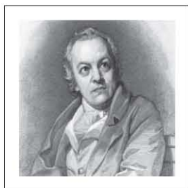
Portrait of William Blake (1808), engraved by Schiavonetti after the painting by Thomas Phillips

"WILLIAM BLAKE, VISIONARY AND ILLUSTRATOR" was the subject of an exhibit at Thomas Cooper Library from July through mid-September. A major focus of the exhibit was the illuminated books and drawings of the English romantic poet who lived from 1757 to 1827.