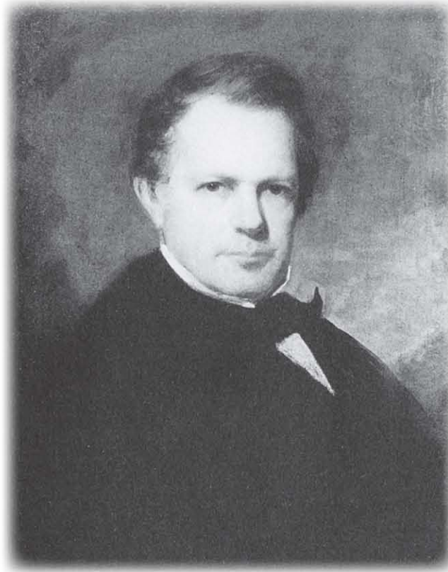
William Gilmore Simms