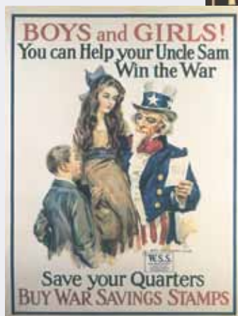
Above left: Boys and Girls! (You can help your Uncle Sam win the War) James Montgomery Flagg Lithograph on paper, 1918 Collection of Thomas Cooper Library, Special Collections, University of South Carolina

Major funding for this combined effort is made possible through a grant from the Institute of Museum and Library Services. For more information regarding this or other exhibitions at McKissick Museum, please consult the museum's Web site at www.cas.sc.edu/mcks/ .