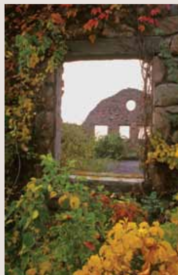
Ruin, Scarborough State Beach, Rhode Island James Henderson Photograph, 2000

In search of the history and beauty of many forgotten and neglected places along US 1, South Carolina photographer James "Jimmy" Henderson set out to travel the 2,390 mile-long road. Making seven trips between fall 1997 and 2001, Henderson photographed many locations that for him captured the essence of each region and the abundance of spectacular views rarely seen by those traveling superhighways such as I-95.