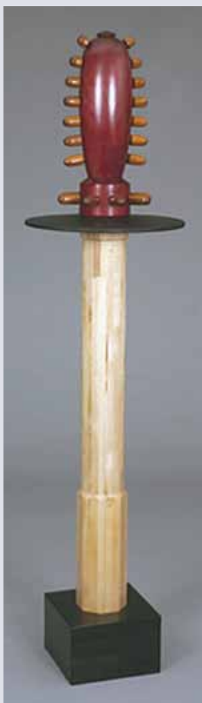
Receiver Bob Lyon Laminated hard maple, ash, cherry, walnut, dyes, lacquer and paste wax 2006

McKissick Museum will again host a biennial exhibition of works produced by USC Department of Art faculty. This exhibit offers visitors an opportunity to view recent works produced by those who teach and help shape future artists at McMaster College. Approximately 40 works of art will be on display with an impressive cross-section of media from painting and sculpture to digital media. Works included in this exhibition showcase the creativity and diversity of talent among the new and existing faculty members of the USC Department of Art.