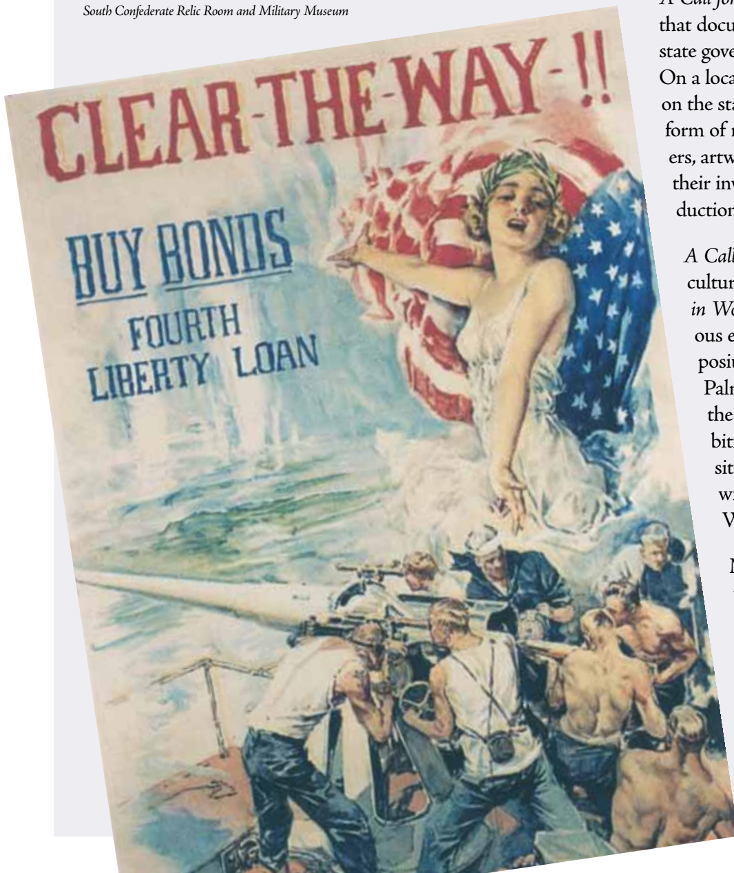
Left: Clear the Way! Buy Bonds (Fourth Liberty Loan) Howard Chandler Christy Lithograph on paper, 1918