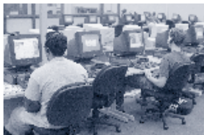
The libraries' computer laboratory offers students the latest technology.

Despite all of the efforts of the Collection Management, Acquisitions, Cataloging, and Reference departments, some patrons still need materials that the libraries do not own. These patrons turn to the Interlibrary Loan Department. Libraries have a long tradition of sharing materials and this tradition is played out every day at the Thomas Cooper Library. Thousands of requests to borrow items from other libraries come in from USC faculty and students at all campuses and a similar number of requests come from other libraries to borrow materials that the USC libraries own. This service literally provides "a library without walls."