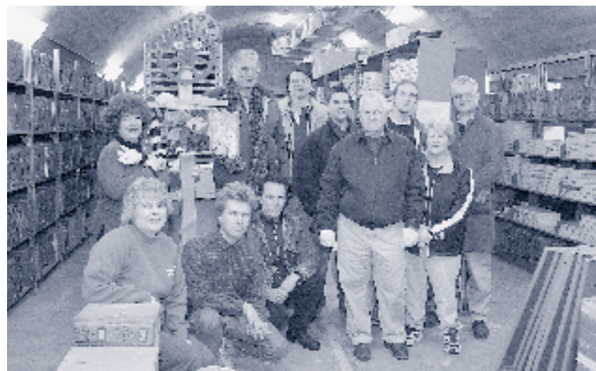
Many library staff members assist with the Film Library's annual inspection of its Movietone Newsfilm Collection.

The laboratory has facilities to treat flat paper, pamphlets, cartographic items, parchment,