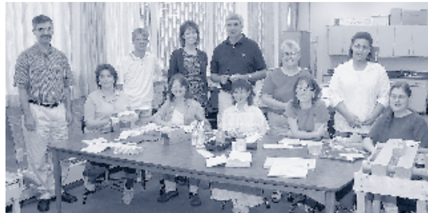
Library staff members work to preserve books from the Thomas Cooper Library's vast collections.

This year a new cataloging and processing service called Marcive was put in place to improve access to the libraries' collection of fed-