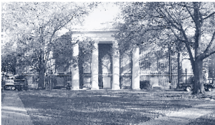
Installing new windows in the South Caroliniana Library.