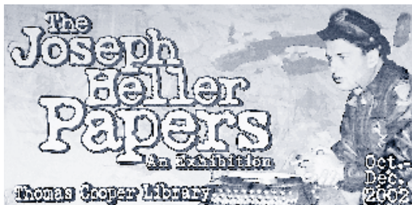
Banner advertising the library's Joseph Heller Papers Exhibition.

Thomas Cooper Society and Thomas Cooper Library events during the year included: