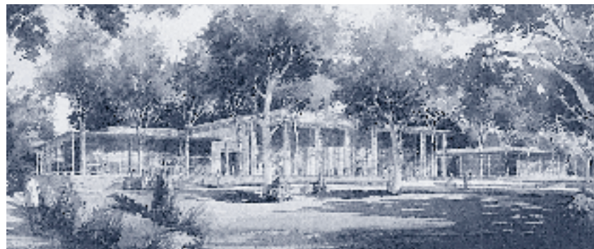
Architect's drawing of the new Special Collections facilities flanking the Thomas Cooper Library.