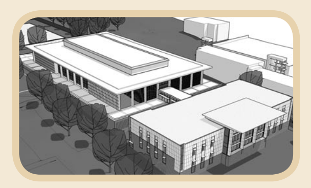
Architect's drawing of the new special collections building

The ground-floor level will house the collections on compact shelving. In order to maximize the shelving capacity of this area, which will have archival quality temperature and humidity control, the ceiling will accommodate nine shelves per section instead of the usual seven shelves, thus increasing shelving capacity by approximately 25 percent. This level will be open to staff only and will provide expansion capacity up to nearly 50 percent.