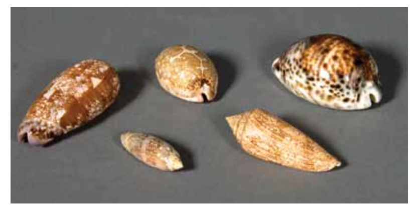
Selection of gastropod shells from the McKissick Collection