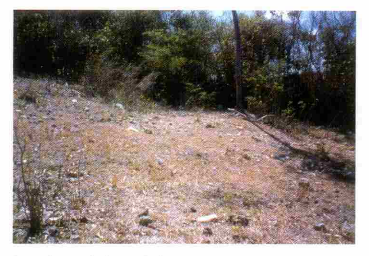
Intact house platform at Habitation Espérance.