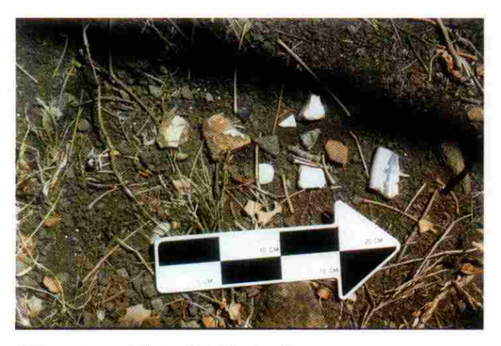
18th-century artefacts at Habitation Guyonneau

Using the CIR in conjunction with modern topographic maps, a number of village sites were selected for field visits: other sites were chosen based upon industrial ruins recorded on modern maps. Features on modern maps not on the CIR were assumed to post-date the 1760s. Understanding the principles used in situating villages (on hilly or otherwise uncultivable land, reasonably close to the industrial complex, etc.) facilitated prediction of likely landforms; field visits usually confirmed these predictions. Target sites were primarily located in regions of Guadeloupe substantially untouched by rapid urban growth or by banana cultivation.