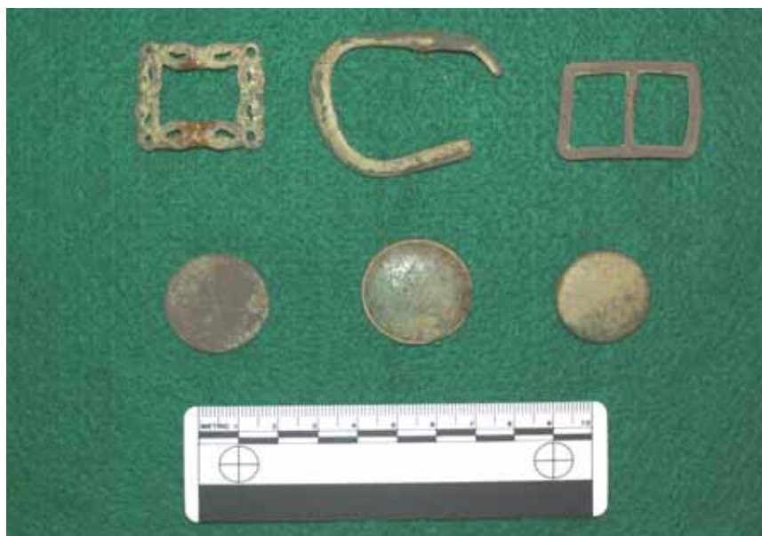
Fig. 5: A variety of buckles and buttons were found during the survey of Williamson's plantation.

Of course the team realizes that it was not the first to discover the Williamson's plantation battlefield since unknown private relic collectors probably knew its location long before the team's find. In fact, their finds may be at least part of the reason for the lack of British musket balls in SCIAA's collection. Nevertheless, the CHM now knows the location and has obtained a collection of artifacts from the battle. The museum can now begin to preserve and interpret the battlefield for public benefit.