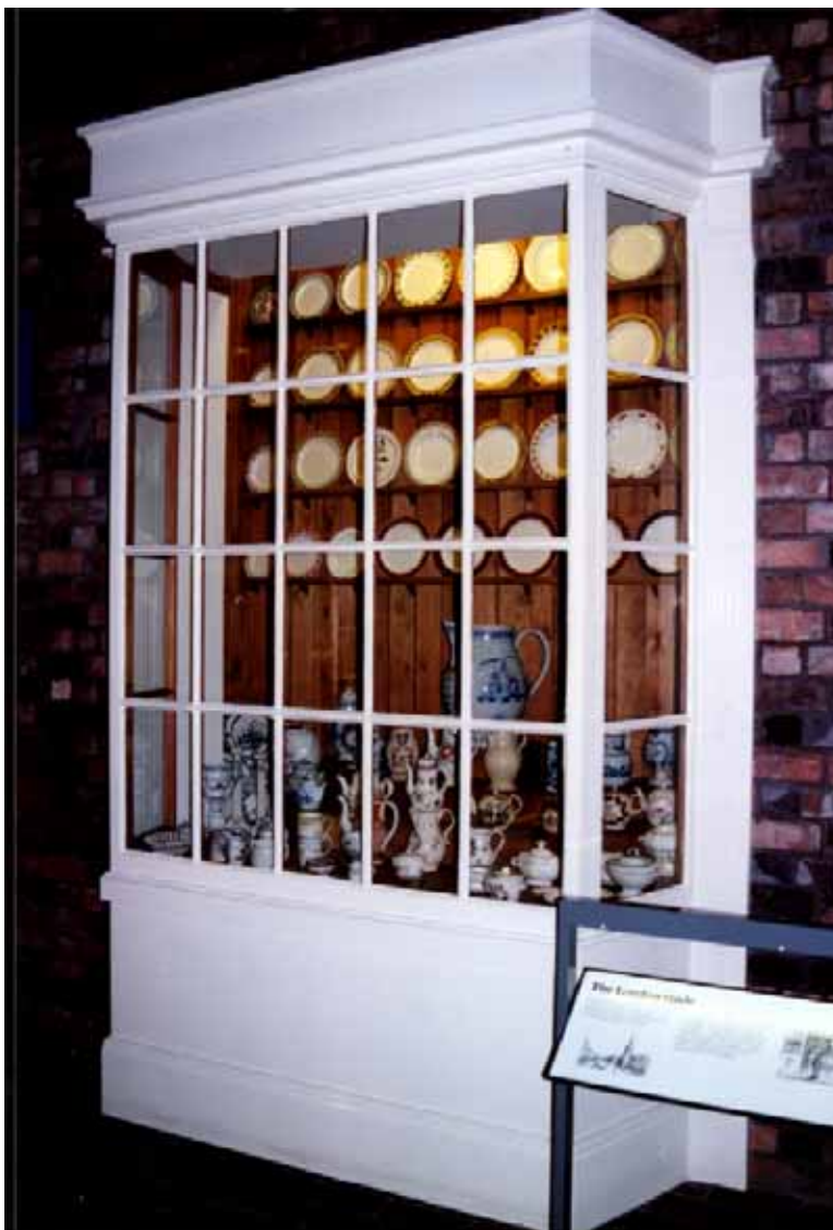
Fig. 1: The Charleston import market offered a range of designs to discriminating customers.

as “Calf’s Head Surprise,” “Pigeon Trans-mogrified,” “Roasted Ox-Cheek,” and “Beef Tongue Fricasay.” Preservation of food was important, and numerous recipes were listed for