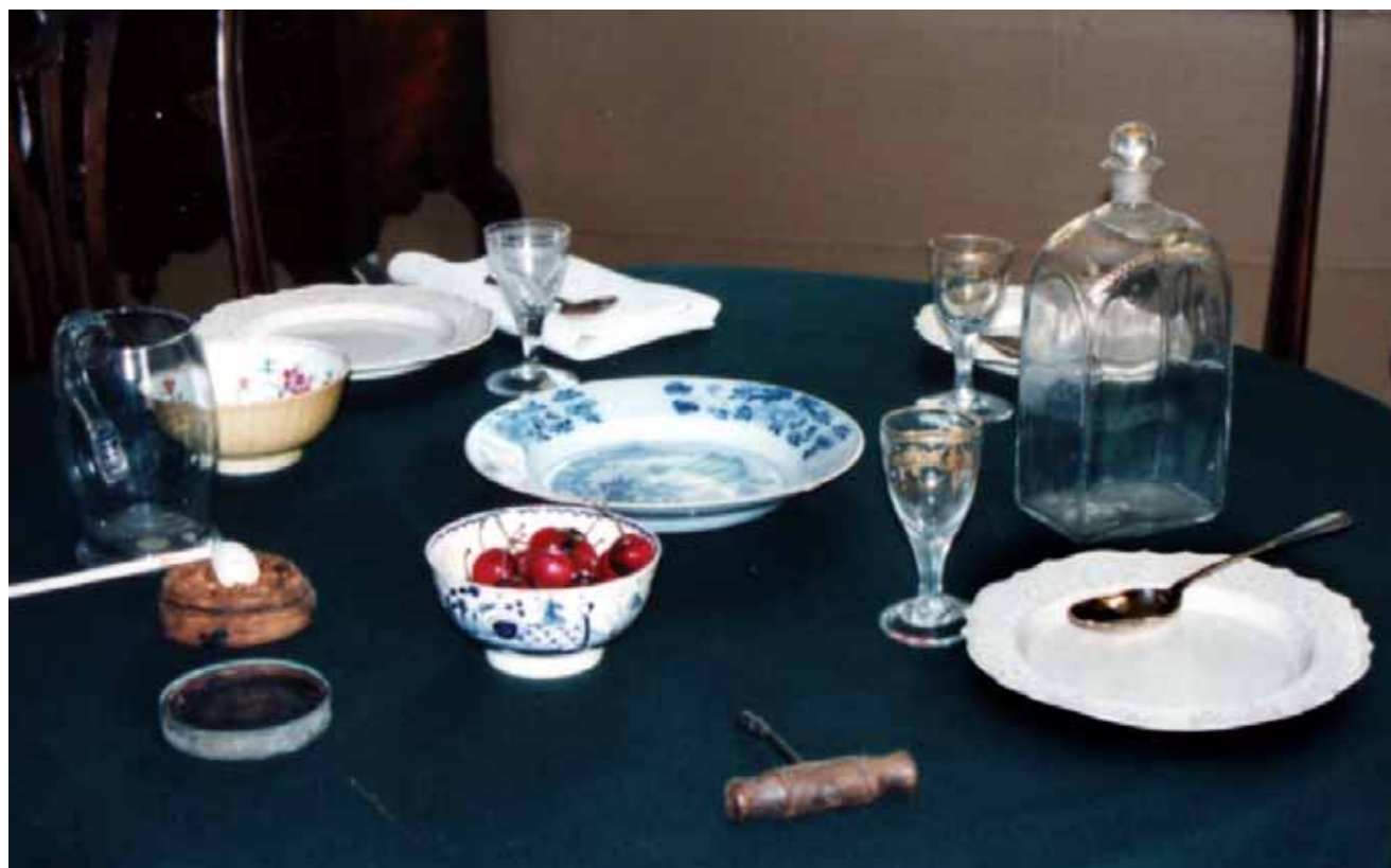
Fig. 3: Imported tablewares in delft, porcelain, and white salt-glazed stoneware.

Punch vessels ranged from 1/2 pint to several gallons, depending upon whether they were for individual or community use. Because of the similarity to bowls used for other purposes, these vessels are distinguished by their location within the house and the materials from which they were constructed. In household inventories, punch bowls were often found in the parlor or "best room," where entertaining would occur. Items associated with the punch service included ladles,