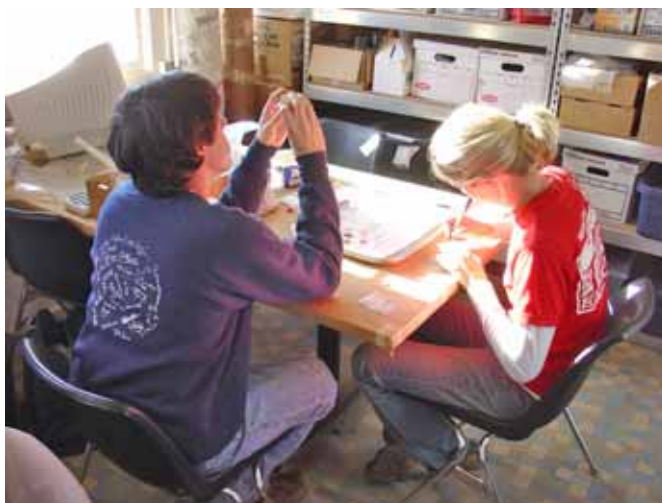
Fig. 4: Wofford College students preparing artifacts for analysis.

As for the previous three years, our continuing research into the prehistory of the Upstate would not be possible without the time and efforts of our tireless volunteers and the support of the Archaeological Research Trust and several private donors. We are deeply indebted to one and all for their continuing support.