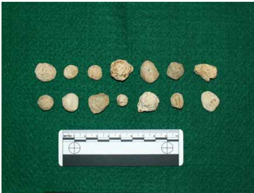
Fig. 2: Fired lead balls from the Hucks Defeat Battlefield.

balls 200 yards east of Bratton's house. That particular location is now a lightly wooded area used as picnic grounds and a reconstructed school house. Relic collector information can be very useful and as that particular information loosely fit the historic accounts, the area was considered another high priority search area.