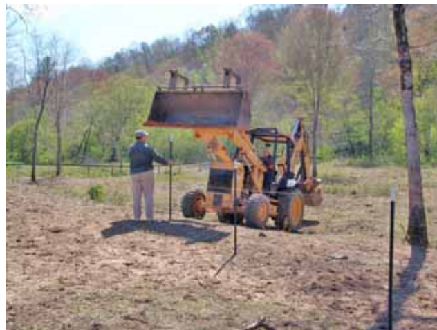
Fig. 1: Erecting the electric fence.

recovered from the level associated with this feature in a one by two-meter unit excavated in the fall of 2006. A backhoe trench cut into a terrace edge near the feature this spring allowed for another one by two-meter unit to be safely excavated adjacent to the 2006 unit. As with the previous unit,debitage was recovered from the level containing the feature. Neither unit produced any diagnostic artifacts.