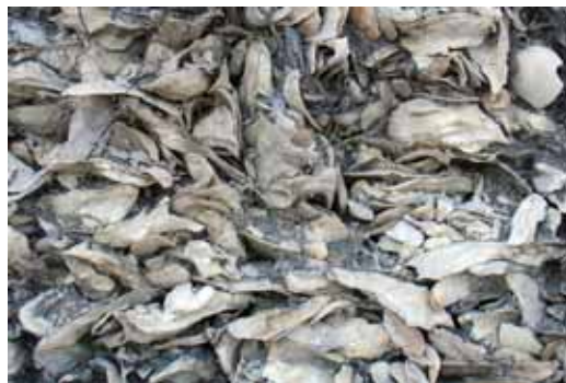
A typical Late Archaic shell mound is dominated by oyster, but also contains crab, clam, and other aquatic, avian, and terrestrial species' remains.