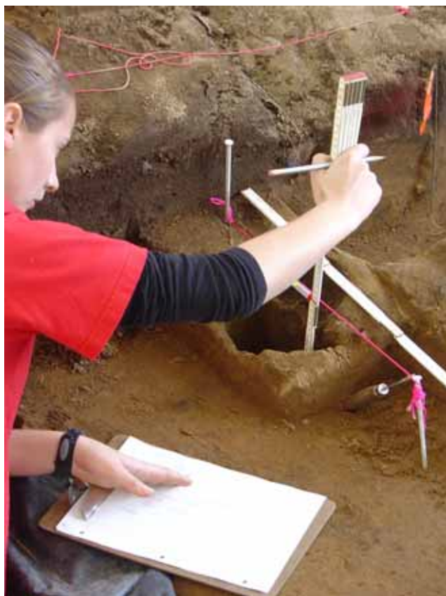
Fig. 3: Excavating a posthole.

equally important Woodland and Archaic cultural components situated above must be painstakingly excavated. This takes time, and because of the huge volume of dirt that must be excavated in order to reach the two plus meter depth safely, no attempt was made to accomplish that this season. Instead, efforts were directed toward excavating shovel tests across the site and the removal of the plow zone from selected areas to find the areas having the greatest research potential and to pursue and map additional segments of the previously discovered palisade (Fig. 3).