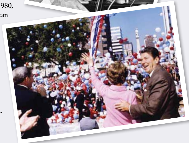
Top: Strom Thurmond giving a speech on the radio